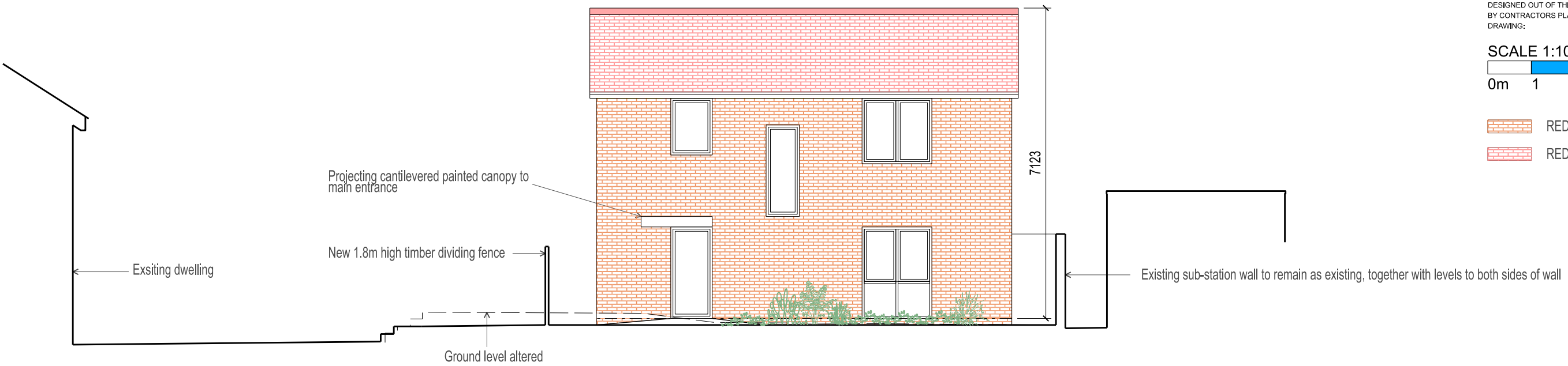
5.00m Datum FRONT ELEVATION (NW) SANDBROOK ROAD ELEVATION DATUM 5.0M