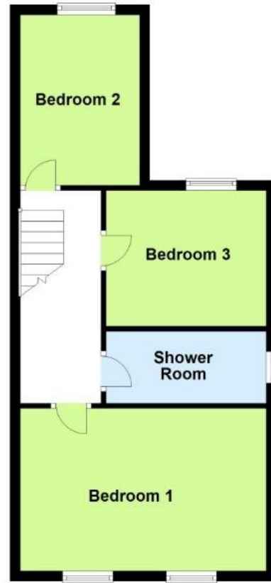
Floor plans are for illustration only and not to scale Plan produced using PlanUp.