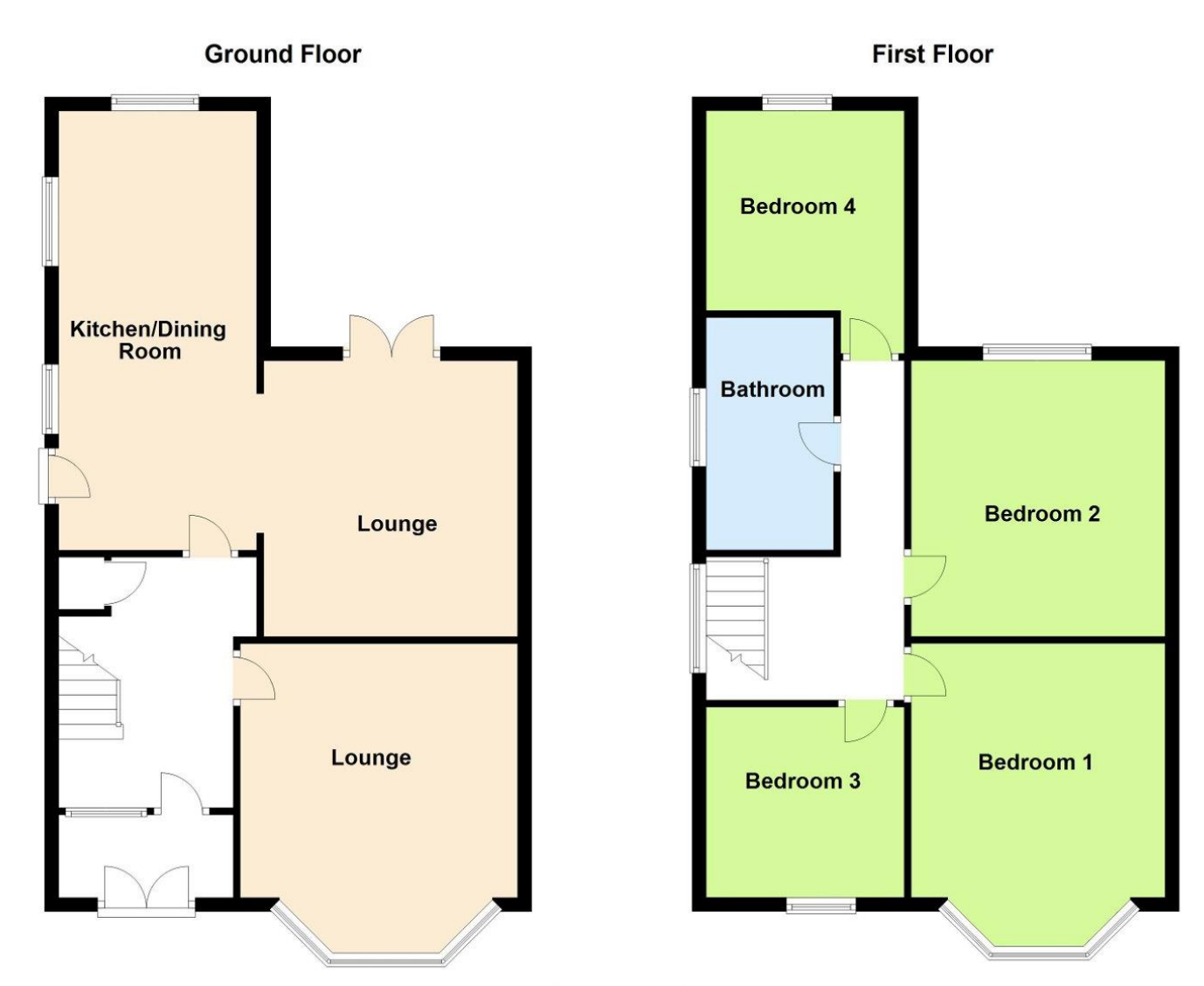
Floor plans are for illustration only and not to scale Plan produced using PlanUp.