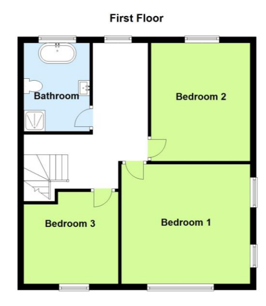
Floor plans are for illustration only and not to scale Plan produced using PlanUp.