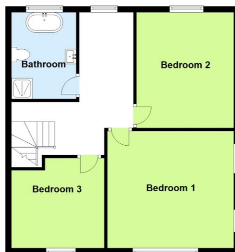
Floor plans are for illustration only and not to scale Plan produced using PlanUp.