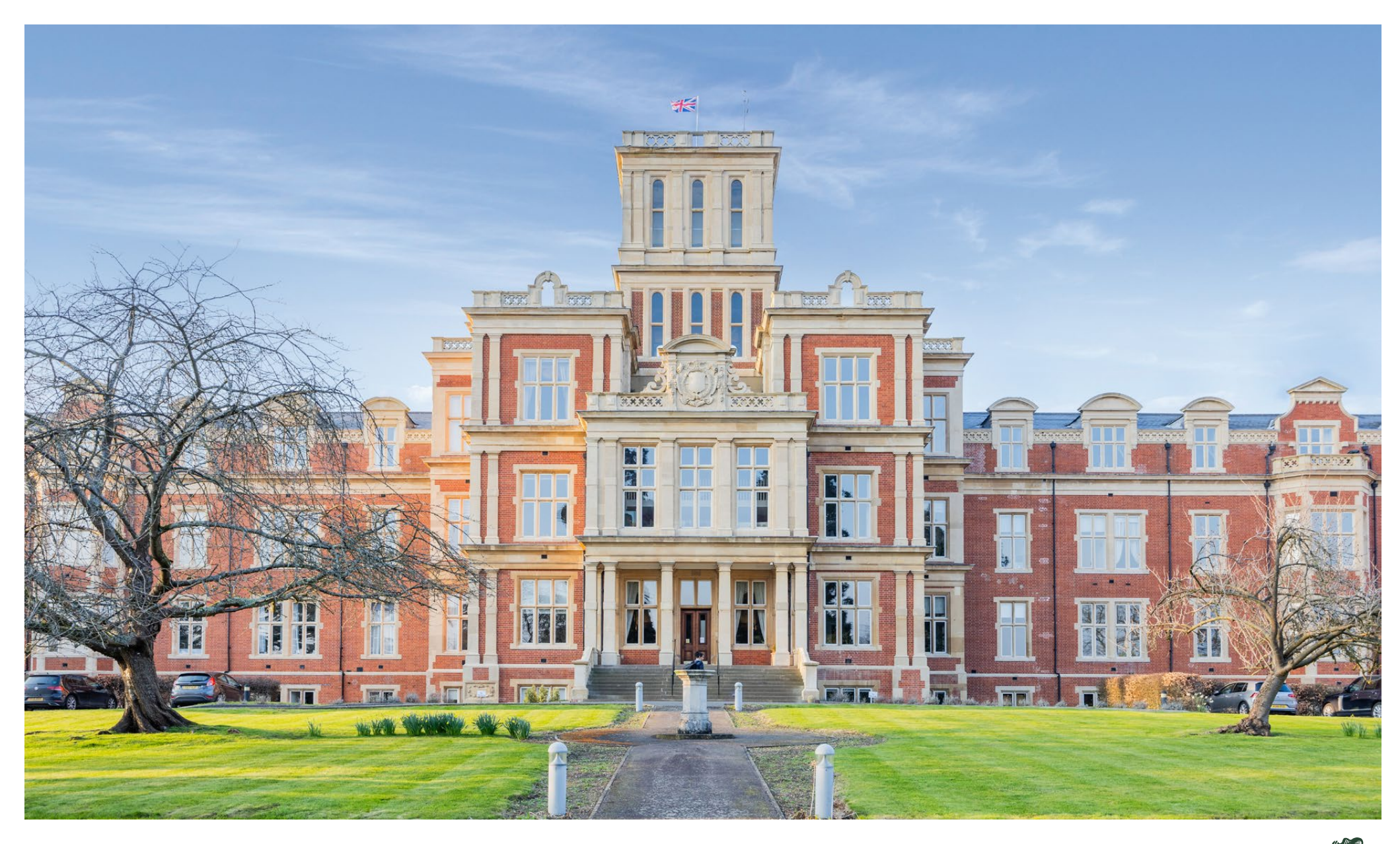
Royal Earlswood Park Redhill RH1 6TE £600,000