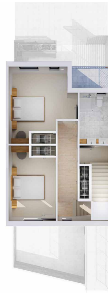
3 BED SECOND FLOOR