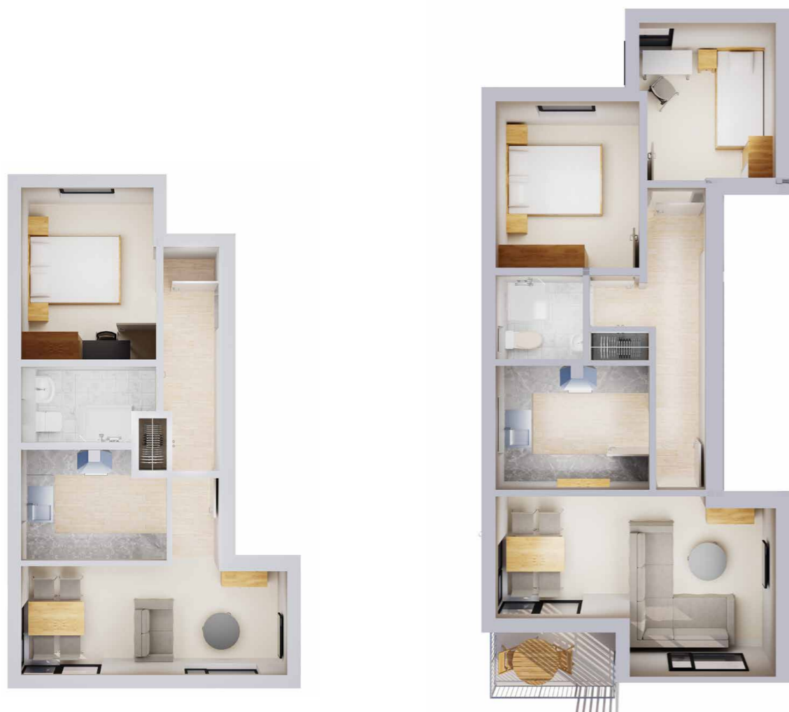
1 BED BLOCK D