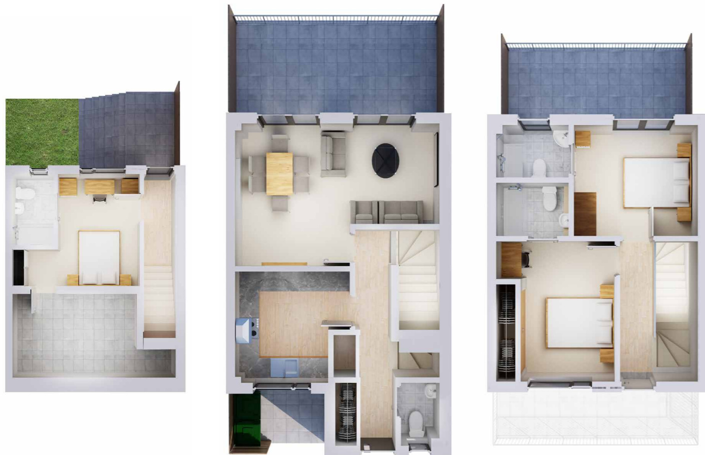
3 BED BLOCK F GROUND FLOOR