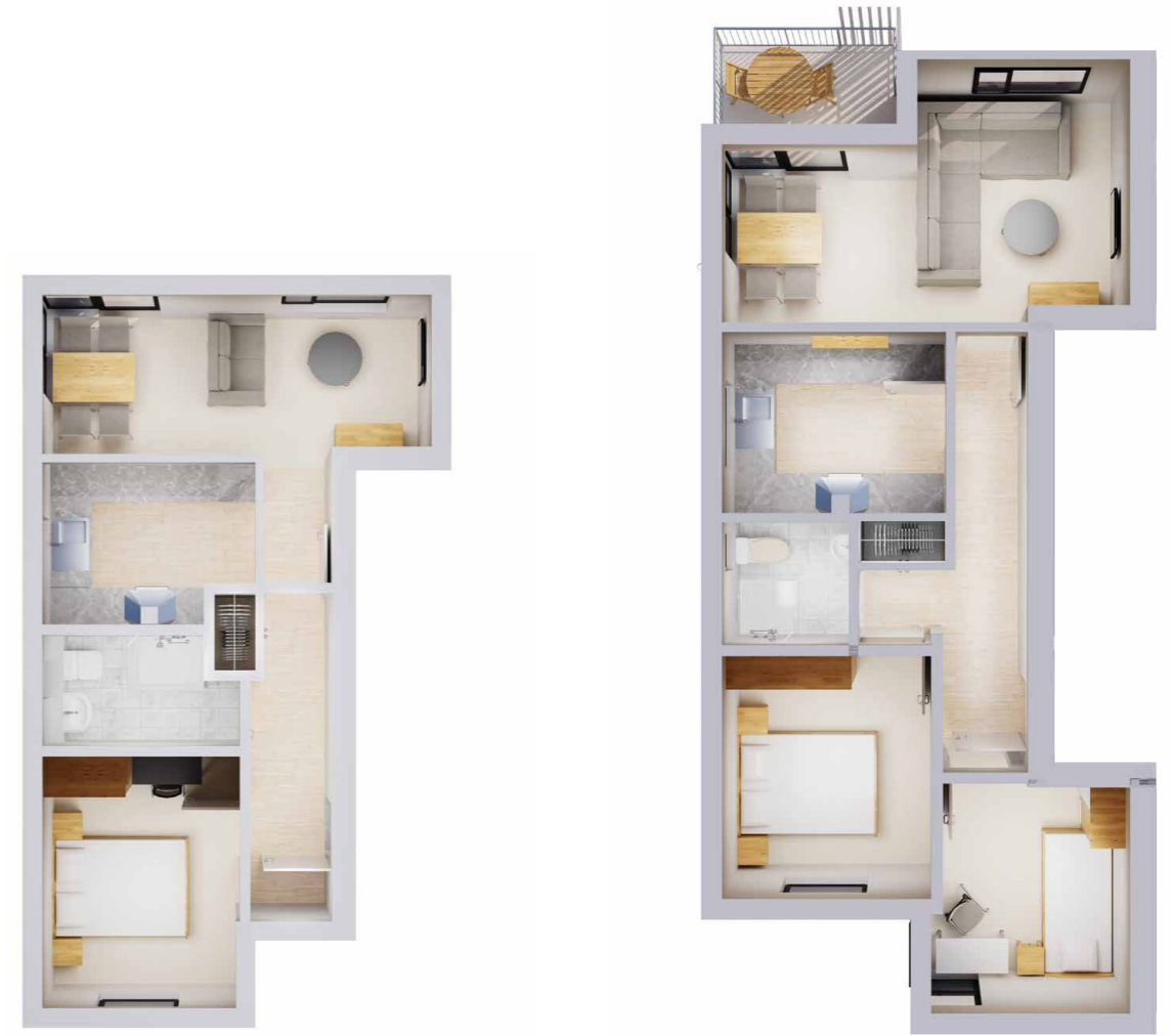
1 BED BLOCK E