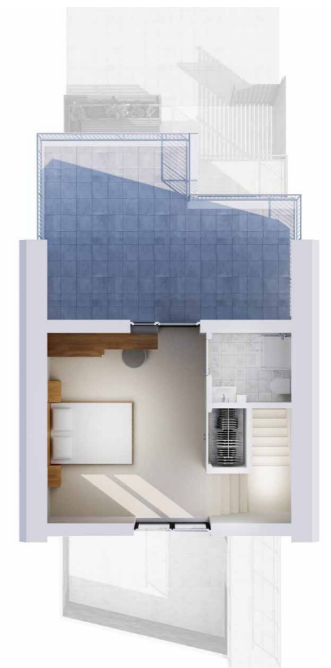
3 BED THIRD FLOOR