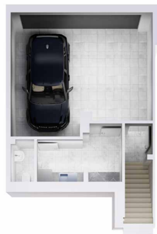
3 BED GROUND FLOOR