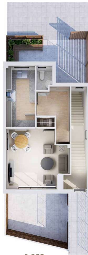
3 BED FIRST FLOOR