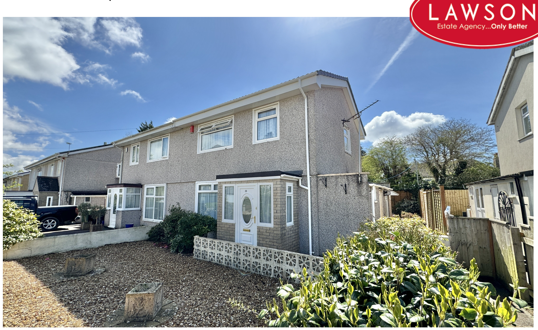
36 SHALDON CRESCENT, WEST PARK, PLYMOUTH PL5 3QY