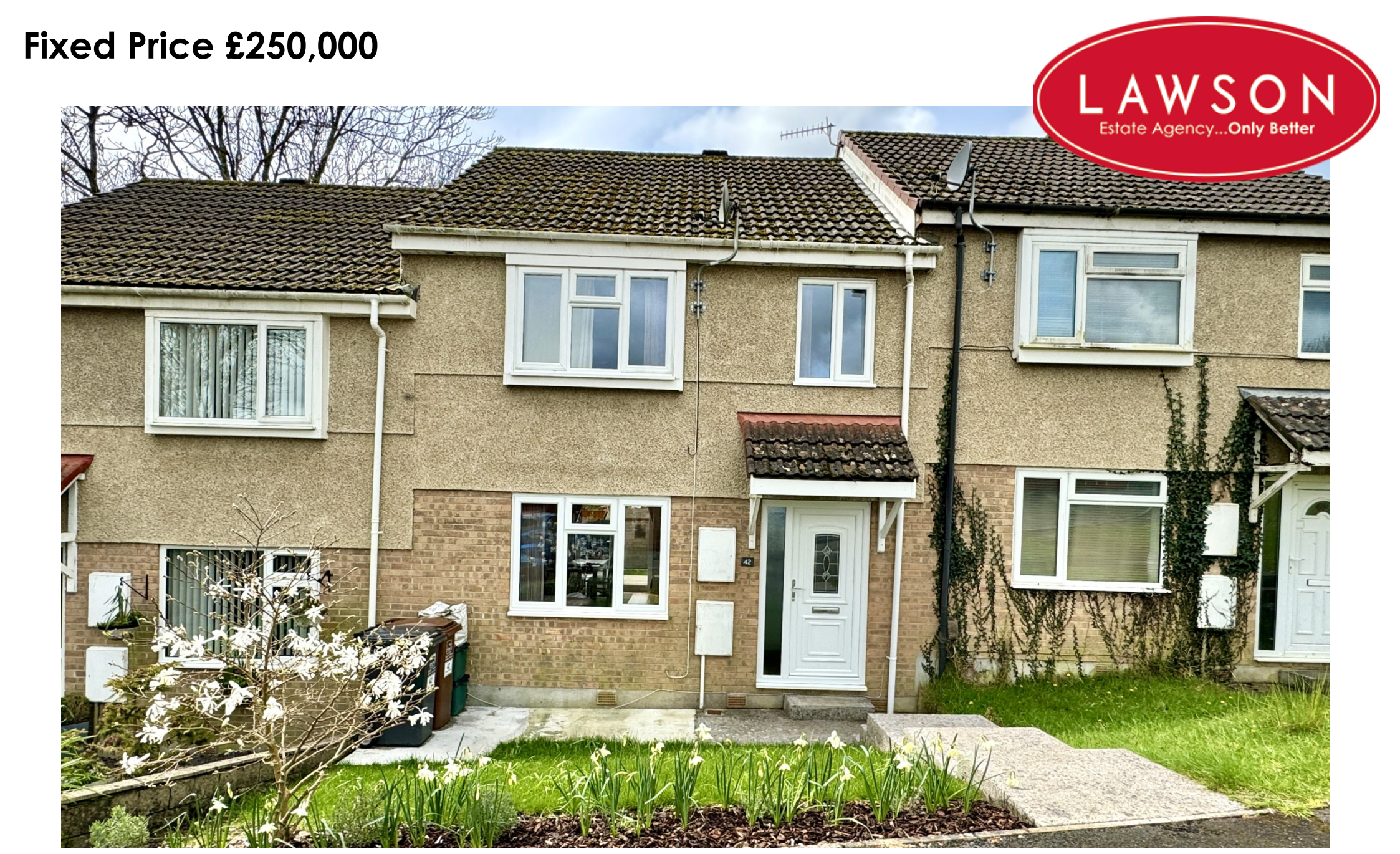
42 CHURCH PARK ROAD, WOOLWELL, PLYMOUTH PL6 7SA