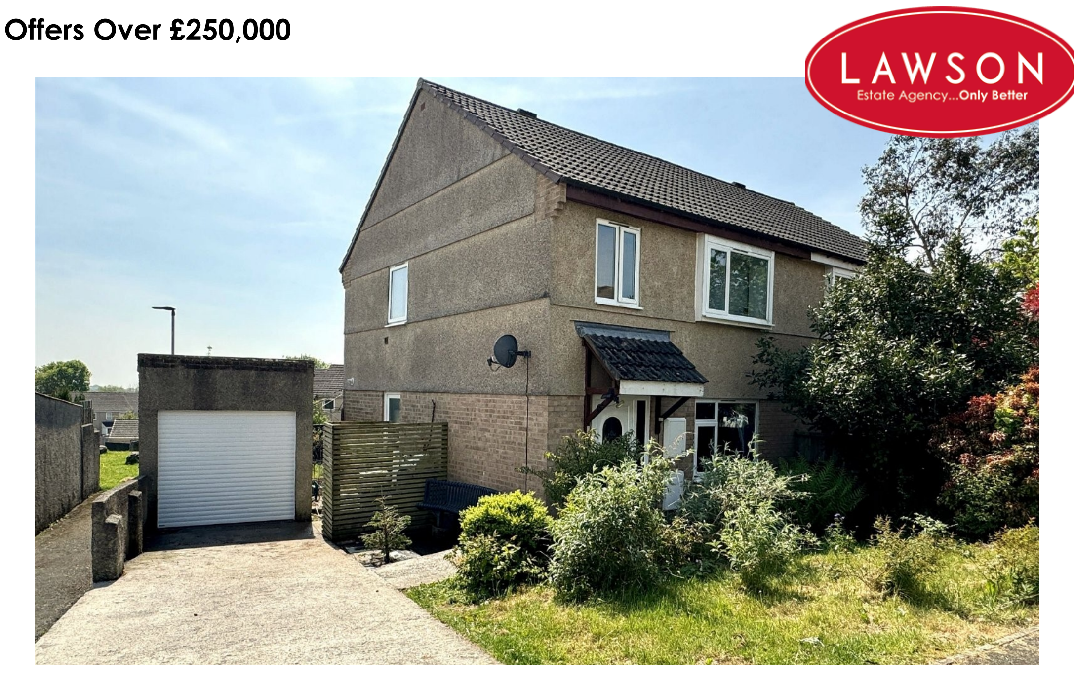
24 CHURCH PARK ROAD, WOOLWELL, PLYMOUTH, PL6 7SA