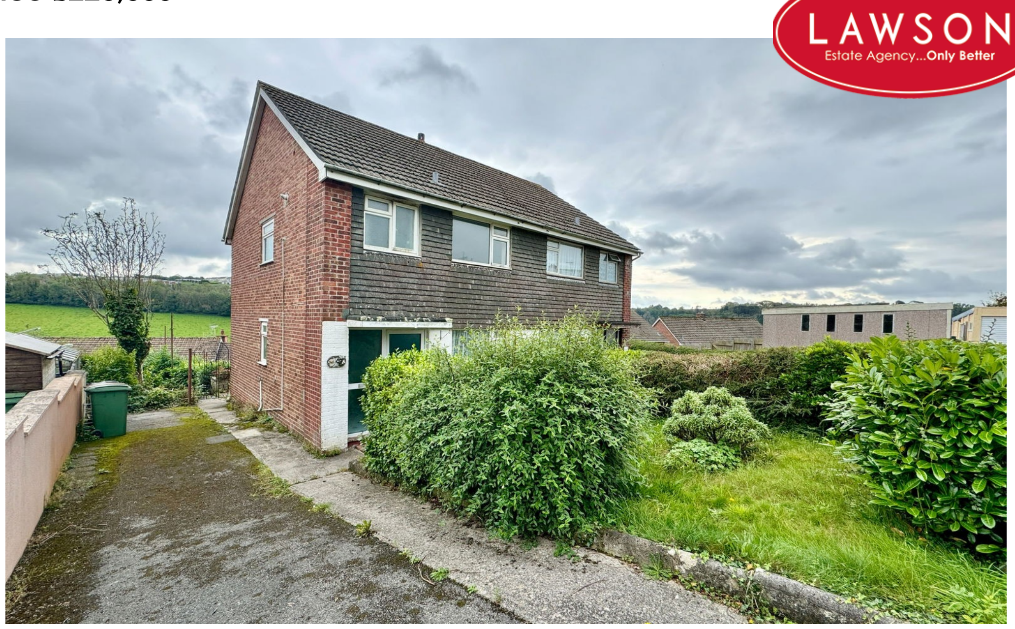
24 HENLEY DRIVE, TAMERTON FOLIOT, PLYMOUTH, PL5 4QB