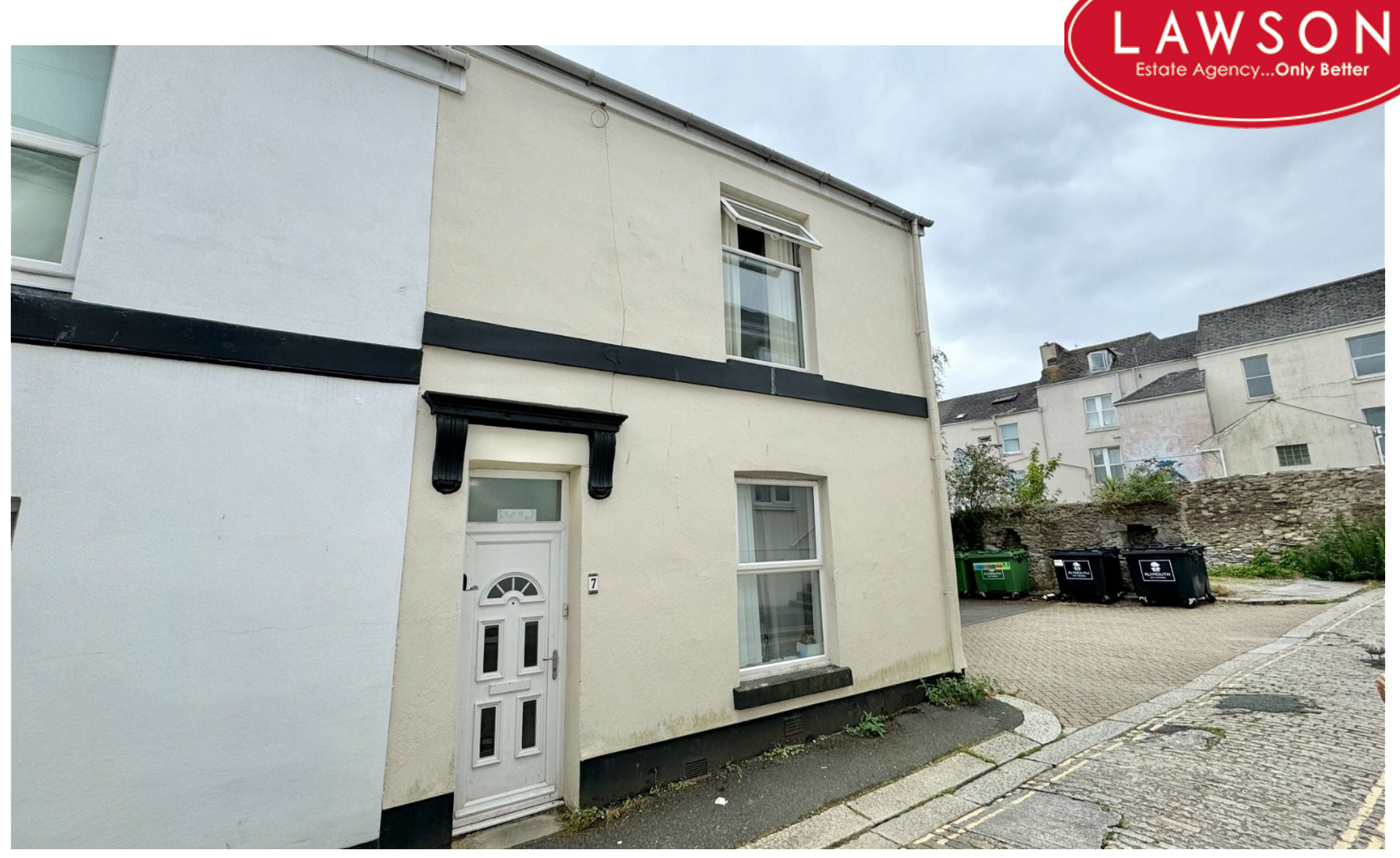
7 GUILDFORD STREET, PLYMOUTH, PL4 8DS