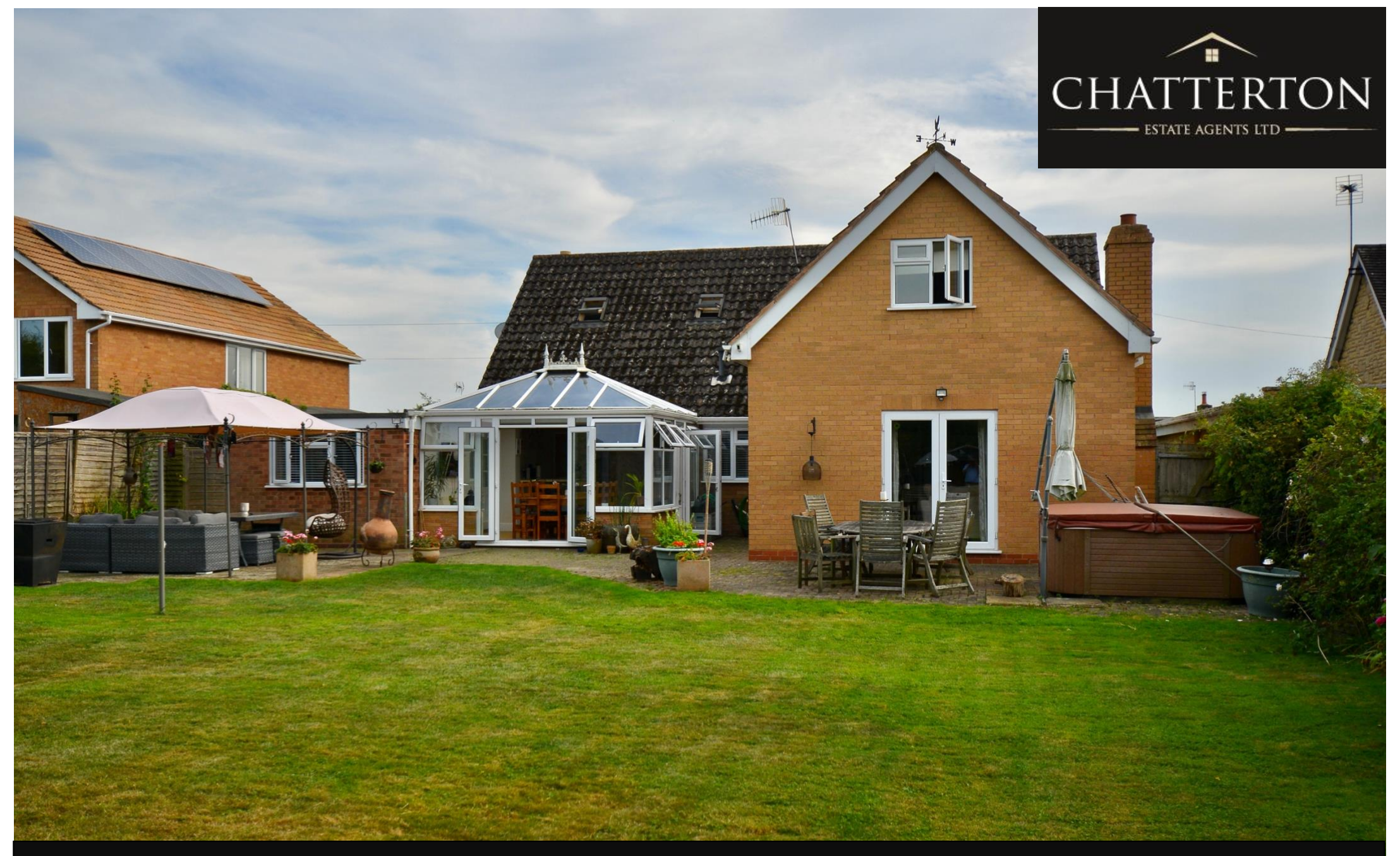
♦ FRENSHAM ♦ BLAKES HILL ♦ NORTH LITTLETON ♦ WR11 8QN ♦ ♦ GUIDE PRICE £745,000 ♦