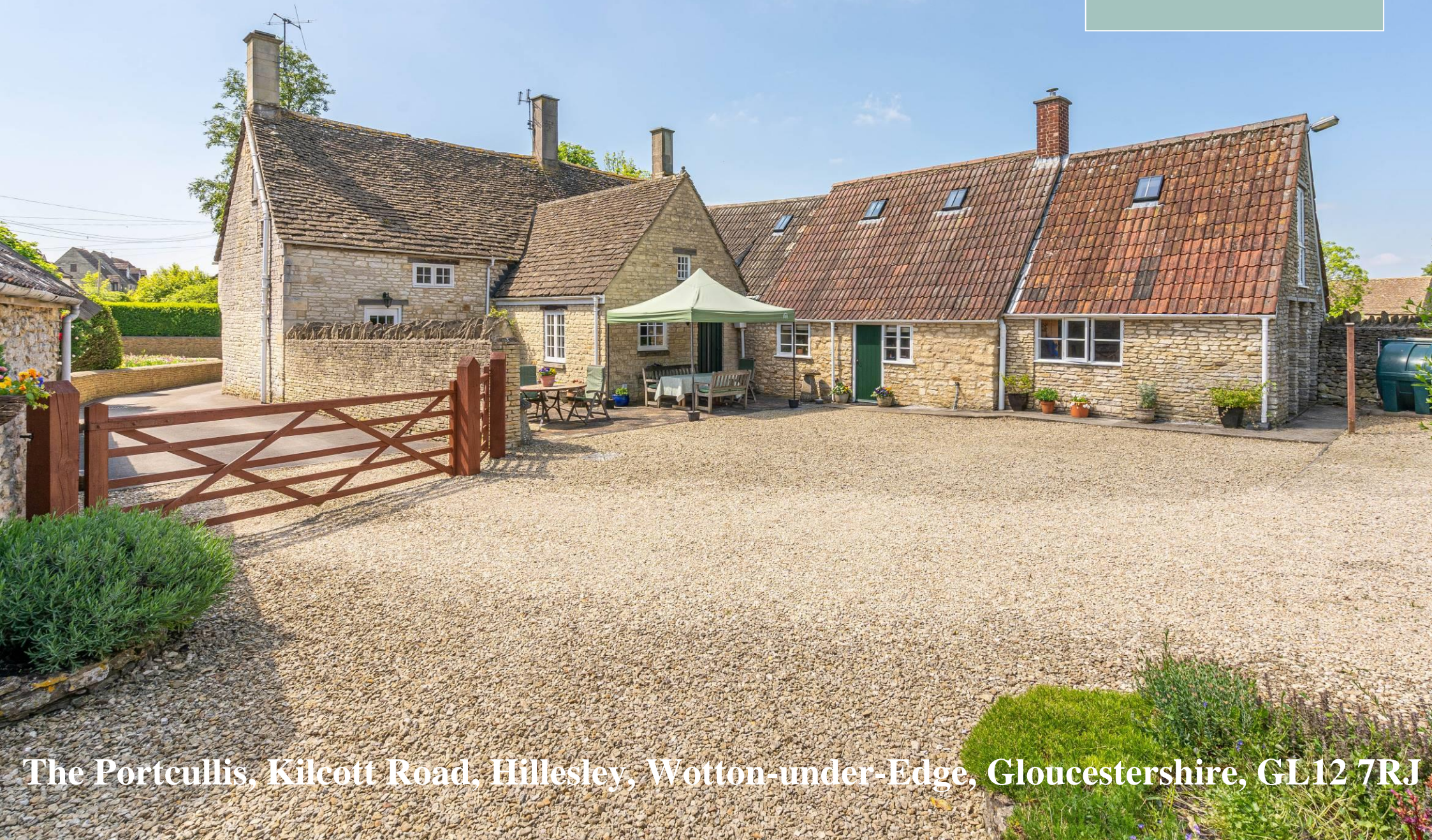
The Portcullis, Kilcott Road, Hillesley, Wotton-under-Edge, Gloucestershire, GL12 7RJ