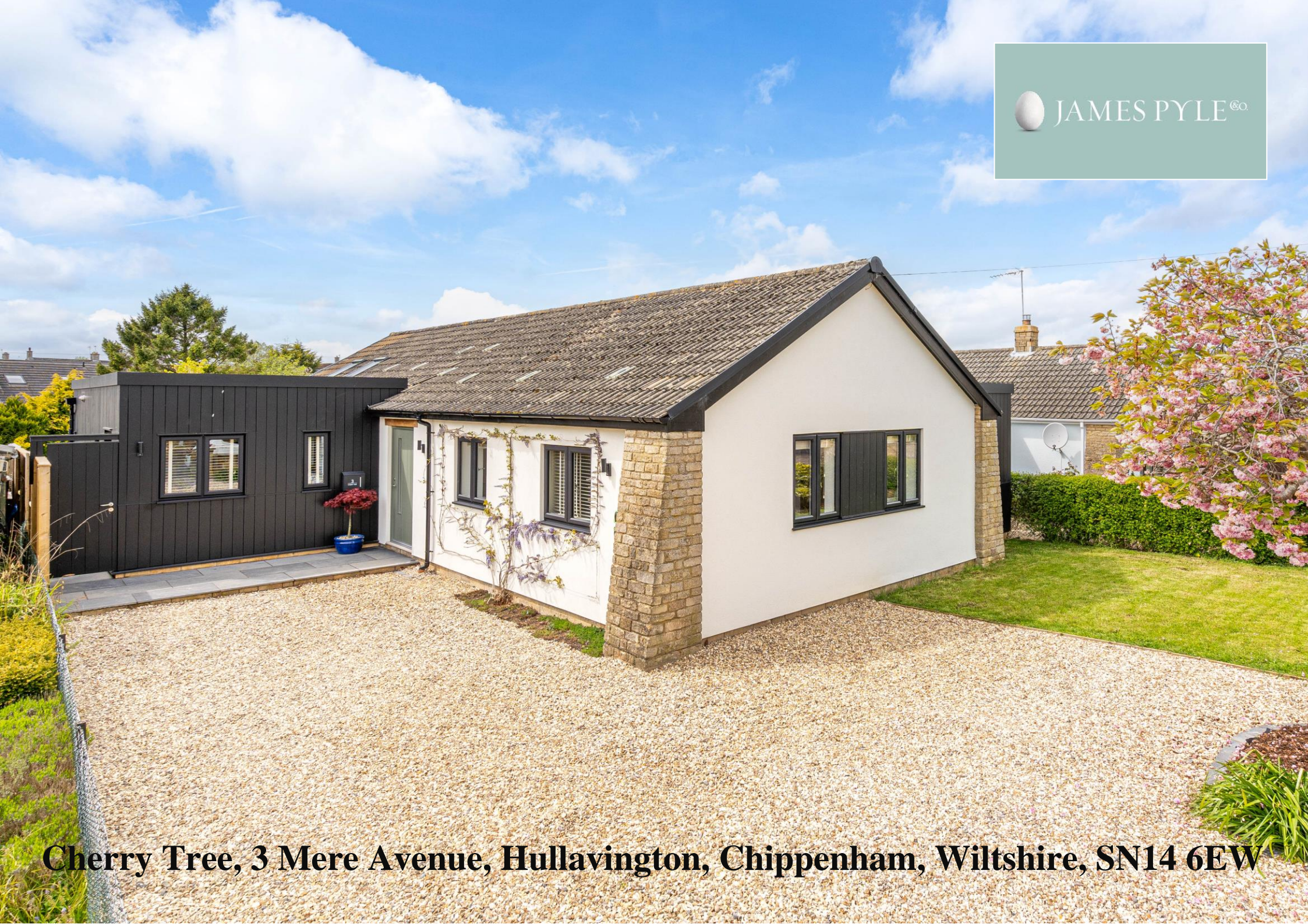
Cherry Tree, 3 Mere Avenue, Hullavington, Chippenham, Wiltshire, SN14 6EW