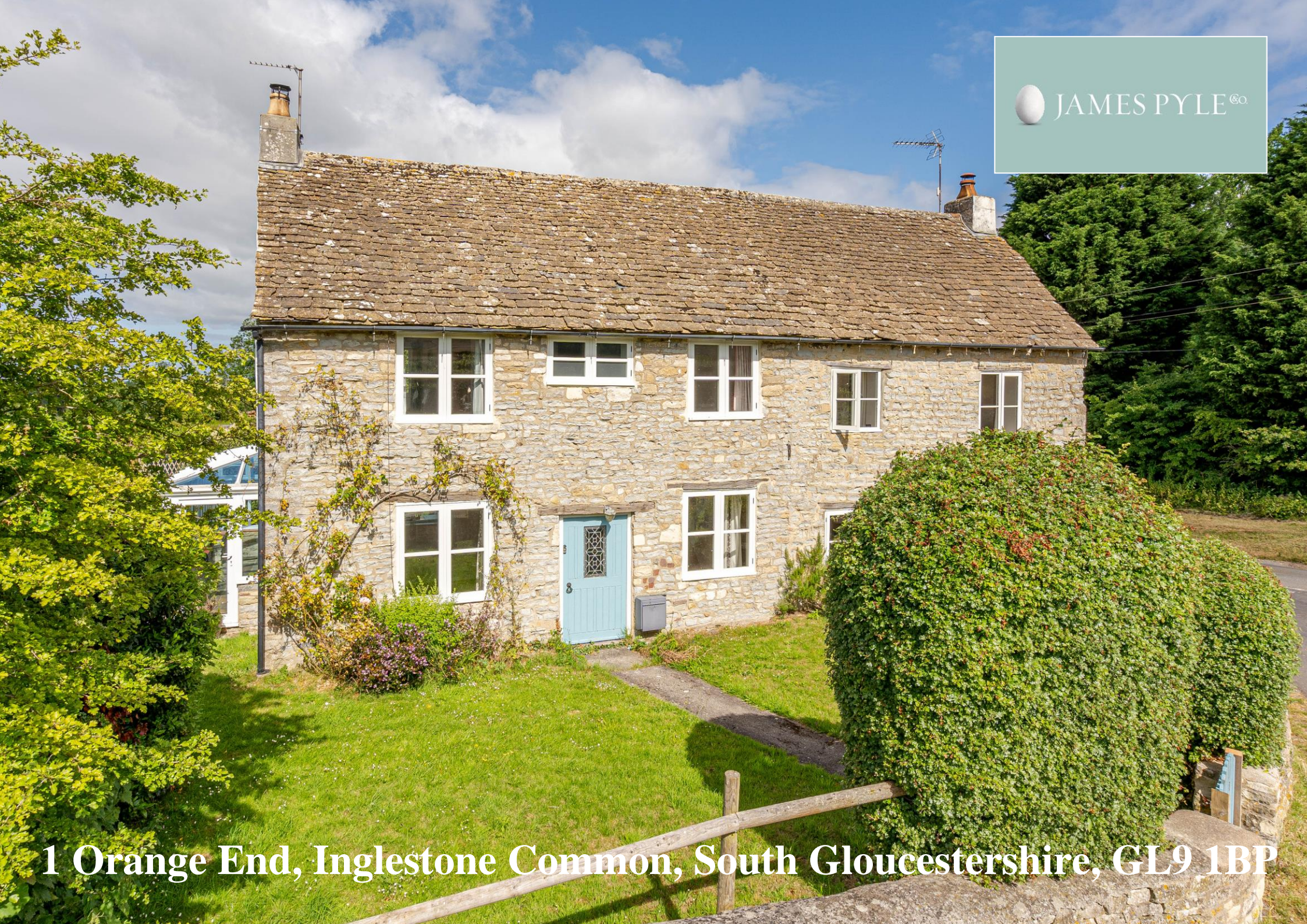
1 Orange End, Inglestone Common, South Gloucestershire, GL9 1BP