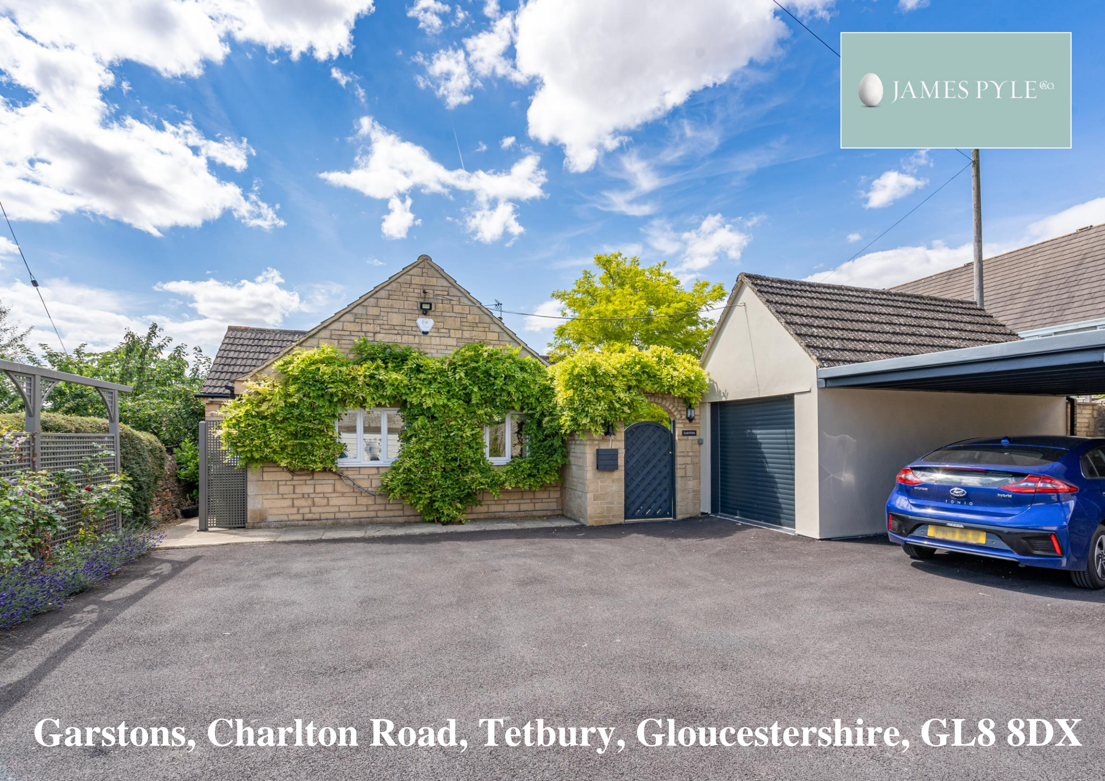
Garstons, Charlton Road, Tetbury, Gloucestershire, GL8 8DX