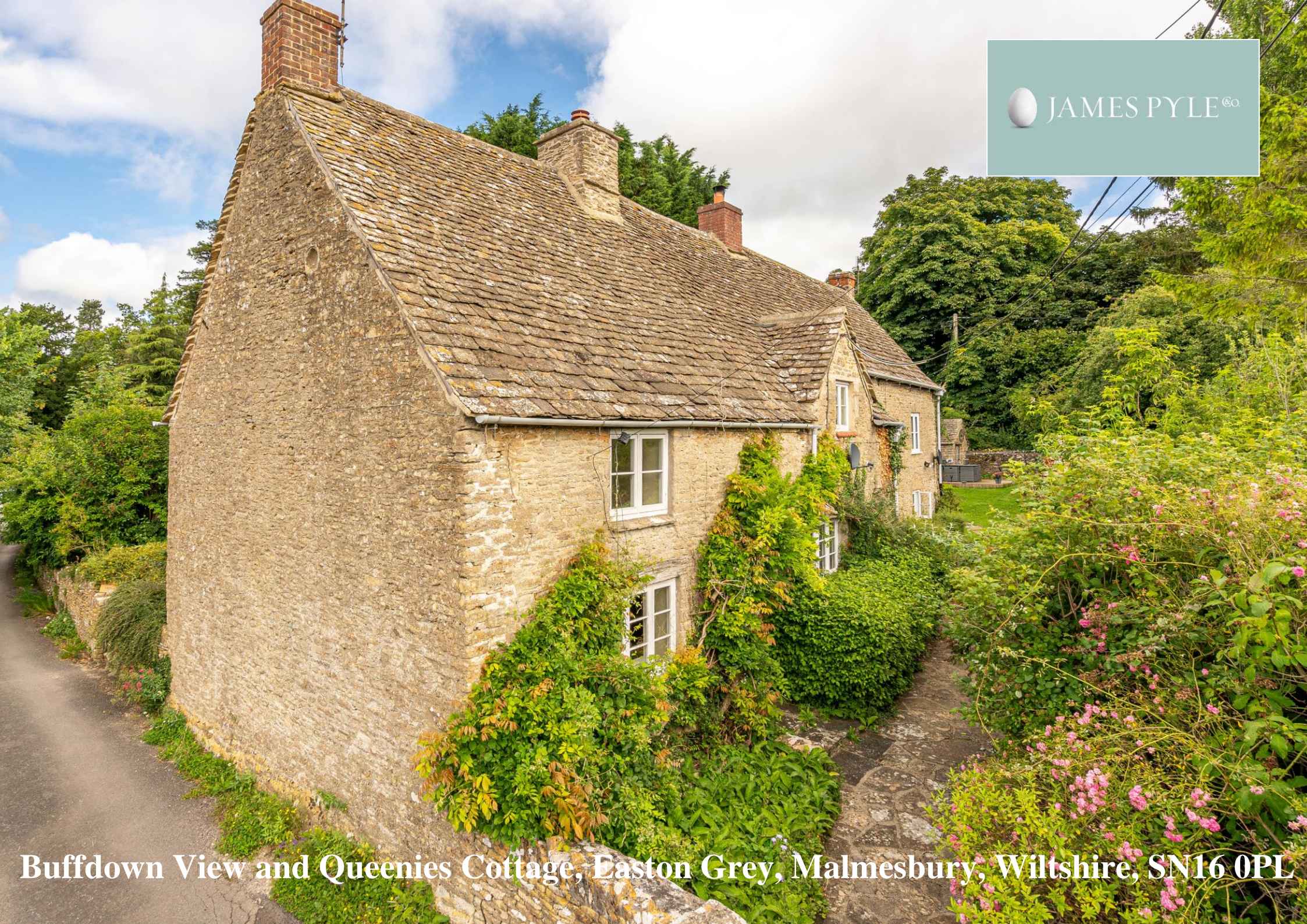
Buffdown View and Queenies Cottage, Easton Grey, Malmesbury, Wiltshire, SN16 0PL