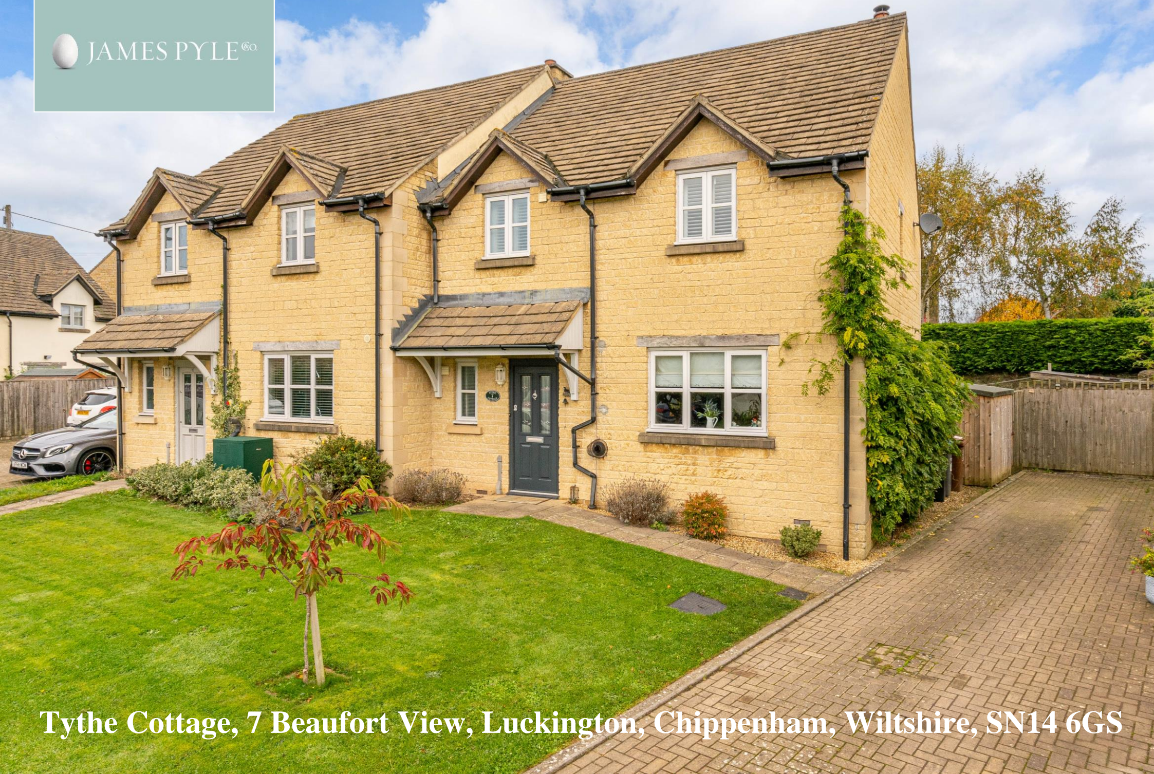
Tythe Cottage, 7 Beaufort View, Luckington, Chippenham, Wiltshire, SN14 6GS