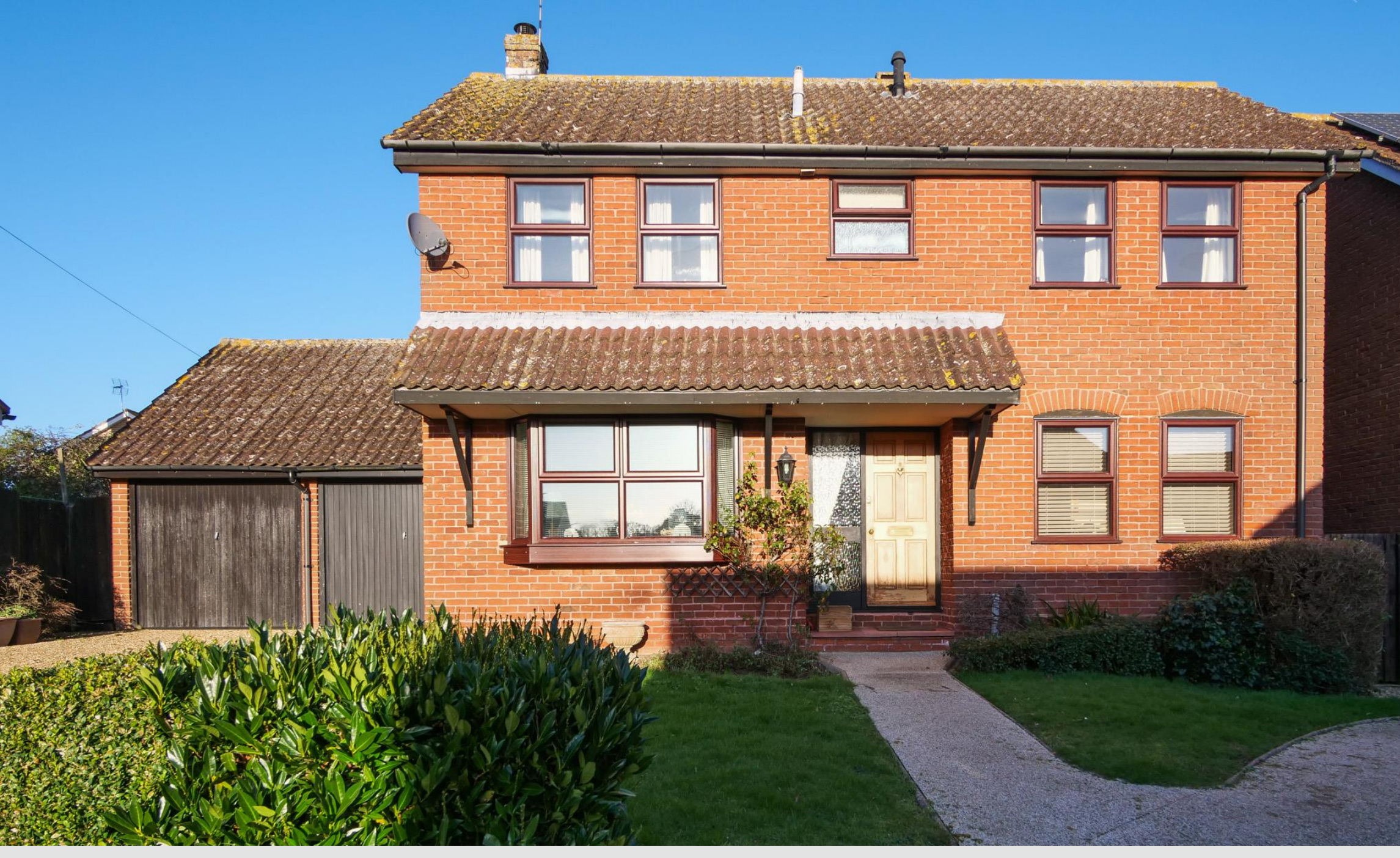
The Mowbrays, Framlingham, Suffolk