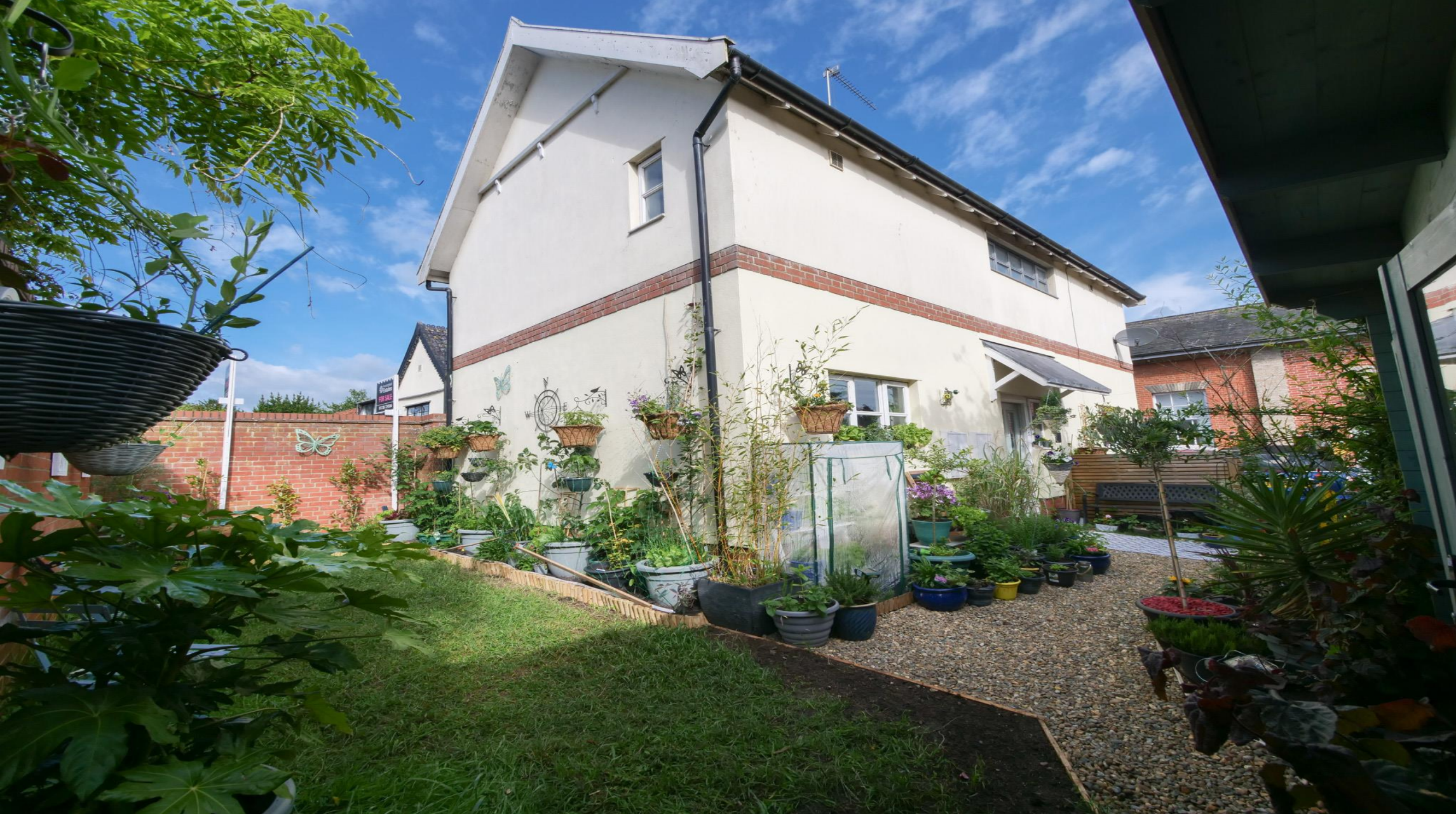
Flat 1, The Foyer, Stradbroke, Suffolk