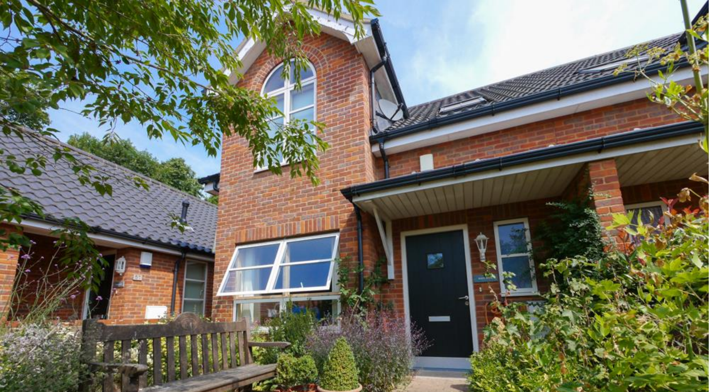
Bailey House, Framlingham, Suffolk