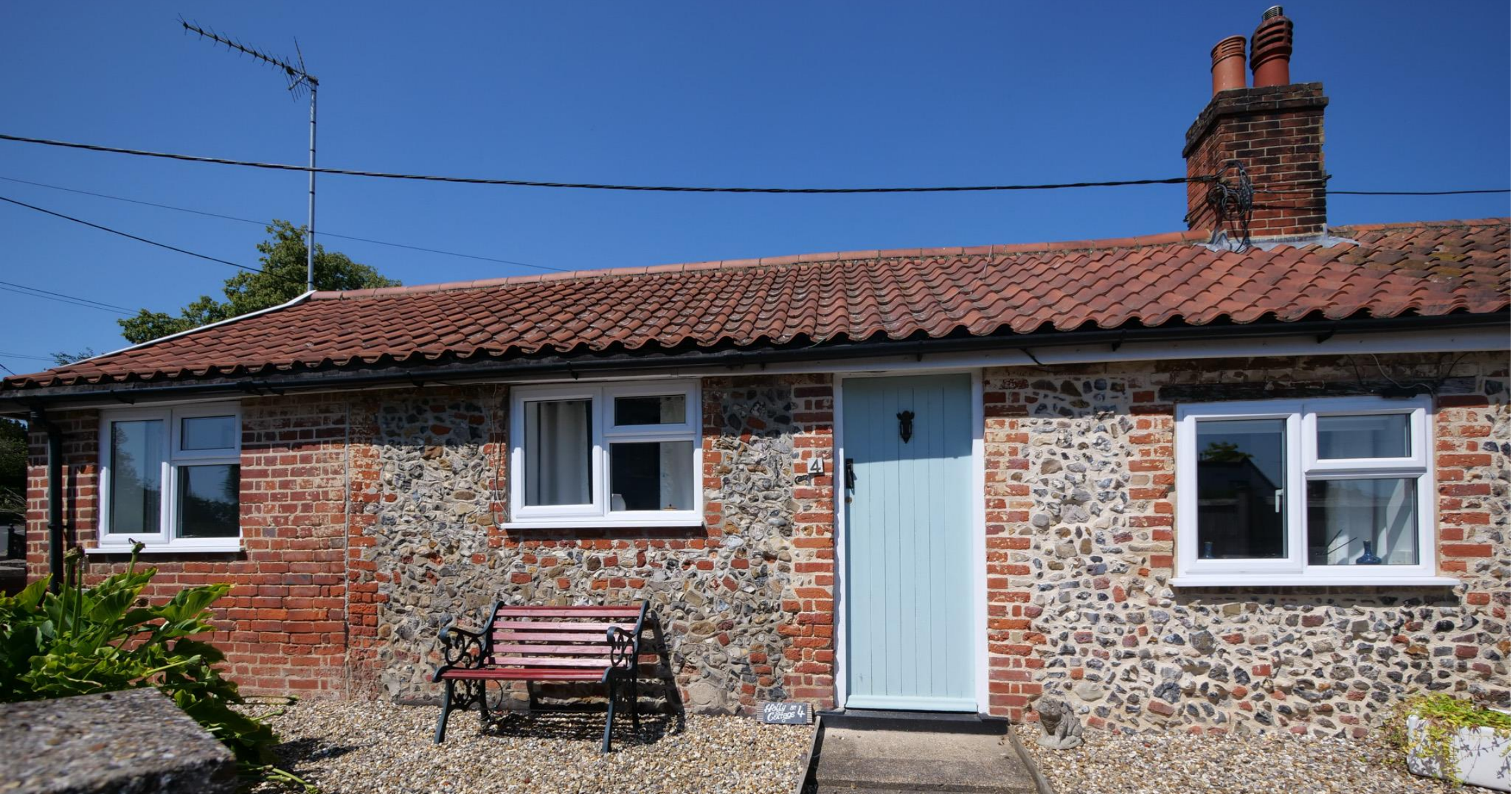
Holly Cottage, Framlingham, Suffolk