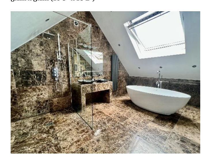
Superb en-suite bathroom with an abundance of space and light created by vaulted ceiling with large velux window and ceiling spotlights. Stylish bathroom suite comprises

luxury free-standing bath with mixer tap and detachable shower hand-piece, 'his and hers' wash basin mounted upon an attractive tiled table, complimenting the wall and floor tiles. Pair of vertical radiators, white low flush W.C with concealed system, a most generous walk-in shower cubicle.