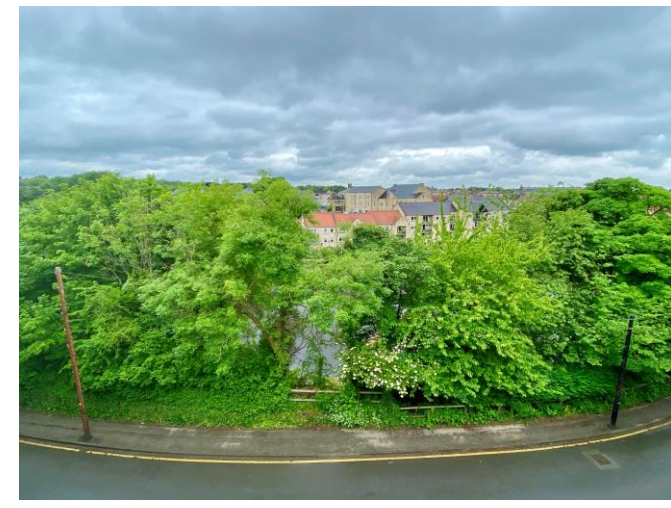
COUNCIL TAX Band F (from internet enquiry).