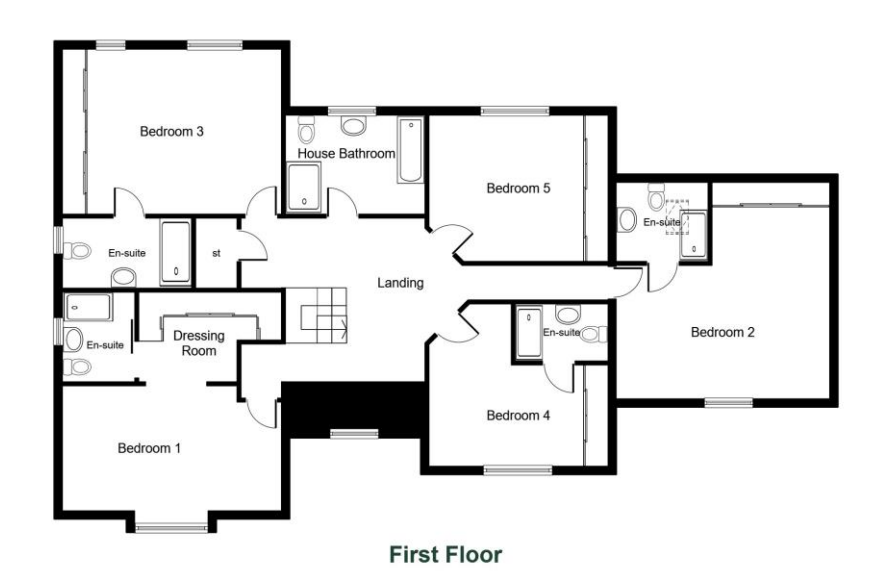
Lilygray, Northgate Lane, Linton Wetherby, LS22 4HN NOT TO SCALE For layout guidance only Total floor area 362.3 sq.m. (3,900 sq.ft.) Approx (Including Garage)