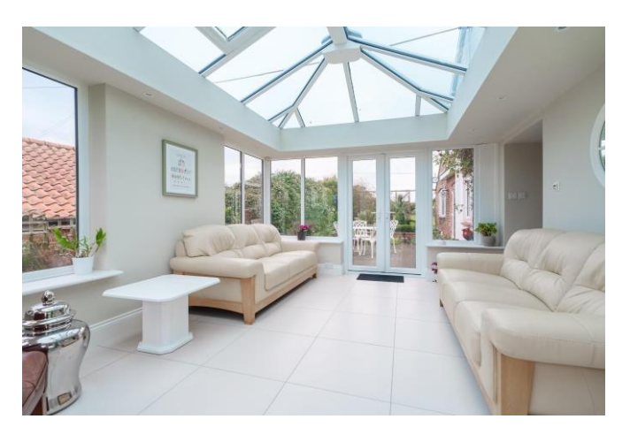
SITTING ROOM 3.96m x 3.96m (13'0" x 13'0")

Having tiled floor and underfloor heating, double glazed windows with views to front and rear, French windows to patio area.