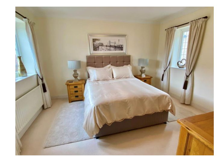
BEDROOM THREE 3.12m x 2.16m (10'3" x 7'1")

3.96m x 3.3m (13'0" x 10'10") plus 1.93m x 1.27m (6'4" x 4'2") including built in double wardrobes. Dual aspect with double glazed windows to front and rear, radiator, ceiling cornice.