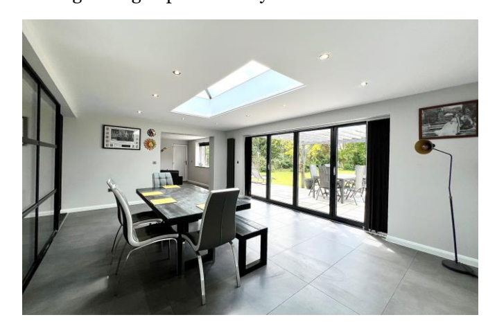
SITTING ROOM 4.08m x 3.6m (13'4" x 11'9")

Extended to the rear a beautiful bright open plan reception space currently used as formal dining with double glazed bi-fold doors onto south facing patio area. Two modern vertically hung radiators, double glazed lantern ceiling window with pelmet lighting and further recess ceiling lighting, attractive tiled floor leading through open archway to:-