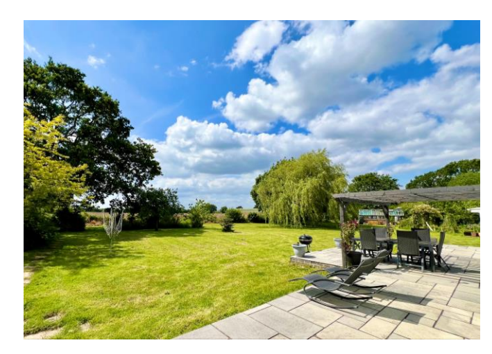
COUNCIL TAX Band F (from internet enquiry).

We understand mains water, electricity and drainage are connected, central heating is oil fired.