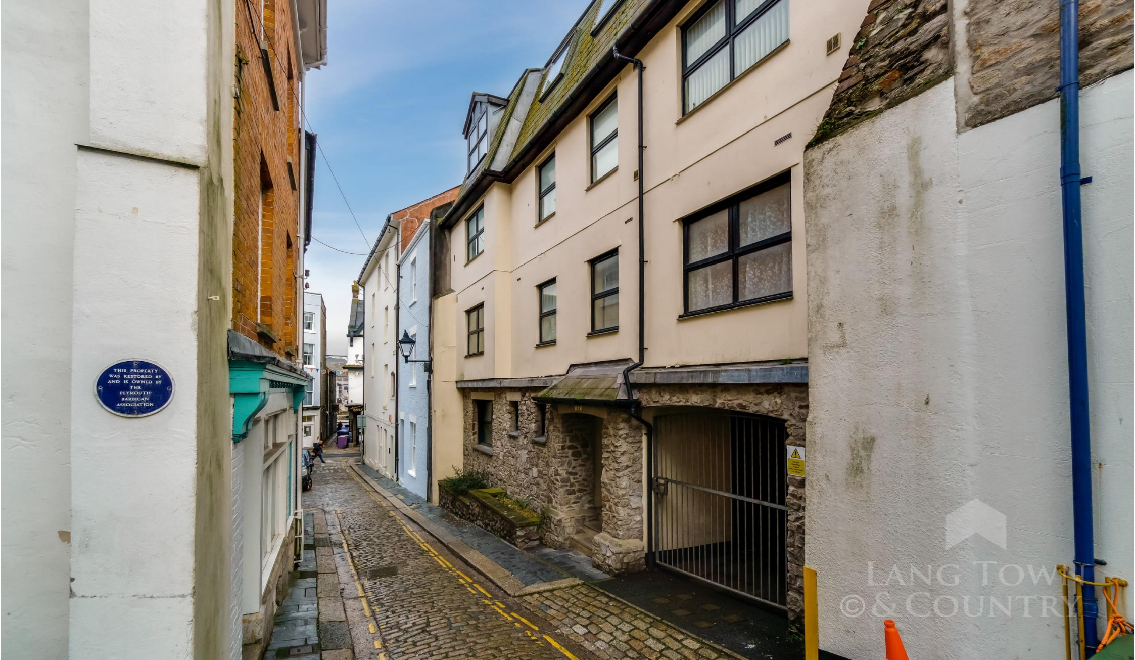
Flat 7, 2-3 Stokes Lane, Barbican, Plymouth, Devon, PL1 2LW