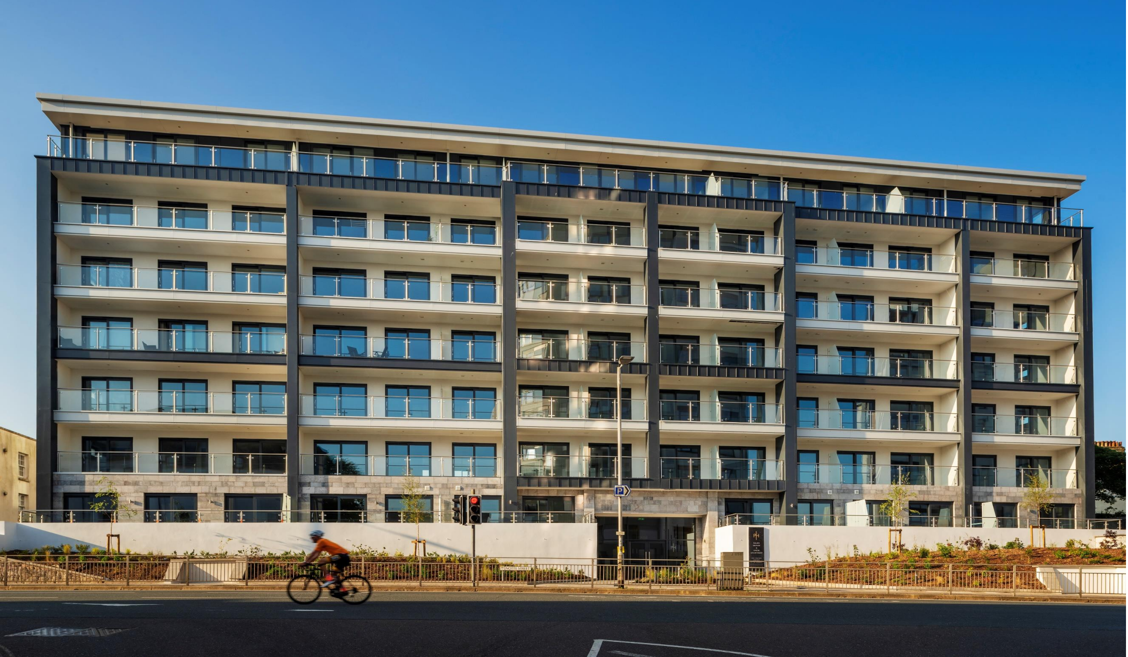
Apartment 29, Peirson House, 175 Notte Street, The Hoe, Plymouth, Devon, PL1 2DT