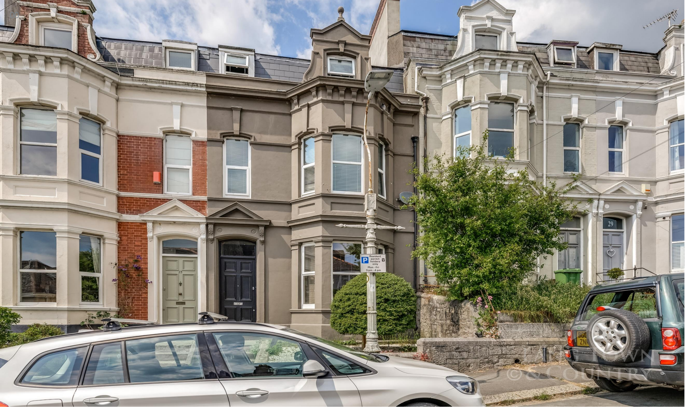
25, Wilderness Road, Peverell, Plymouth, Devon, PL3 4RN