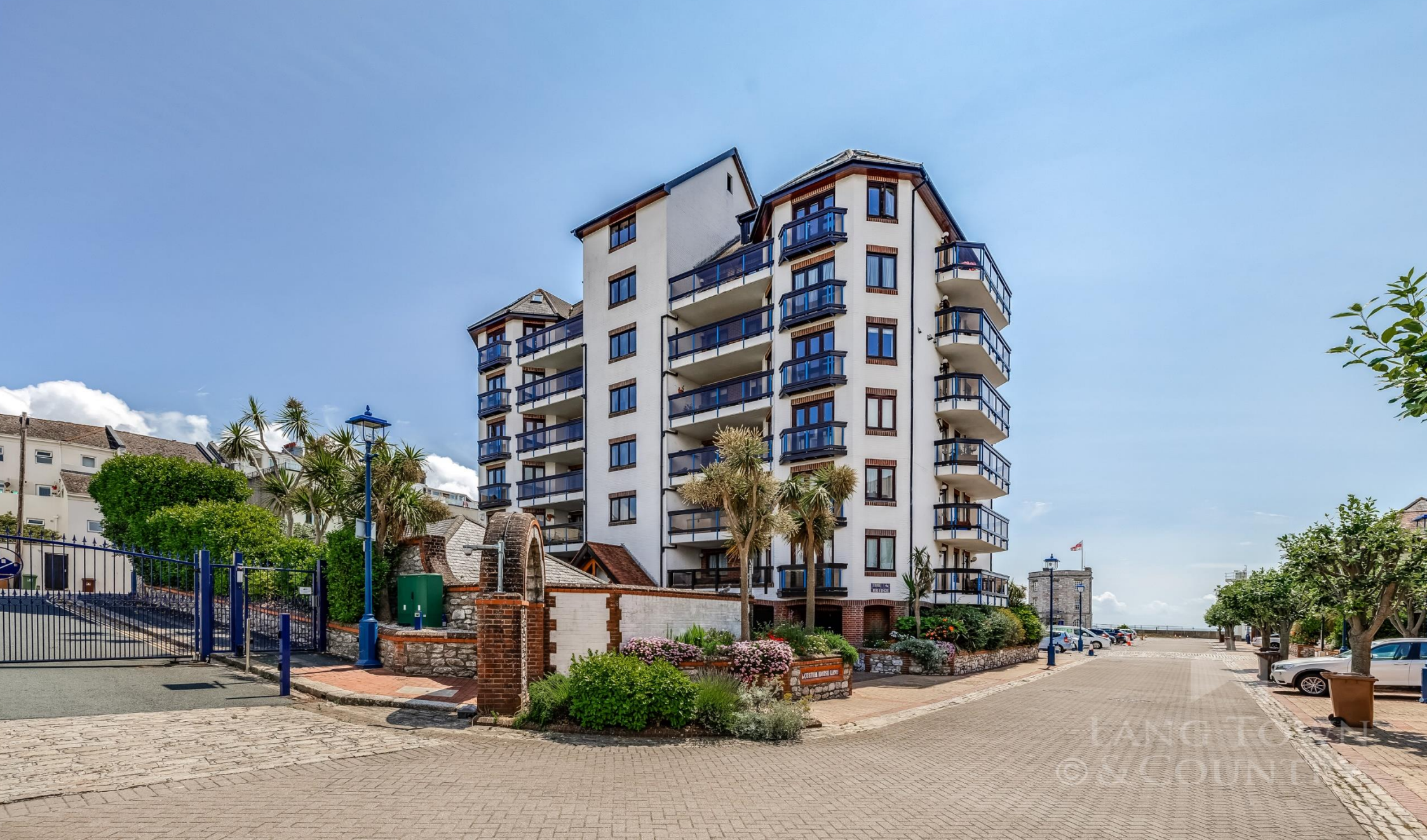
Flat 9, The Bridge, Custom House Lane, West Hoe, Plymouth, Devon, PL1 3TB