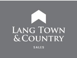
11 Swallows End, Plymstock, Plymouth, Devon, PL9 7DZ