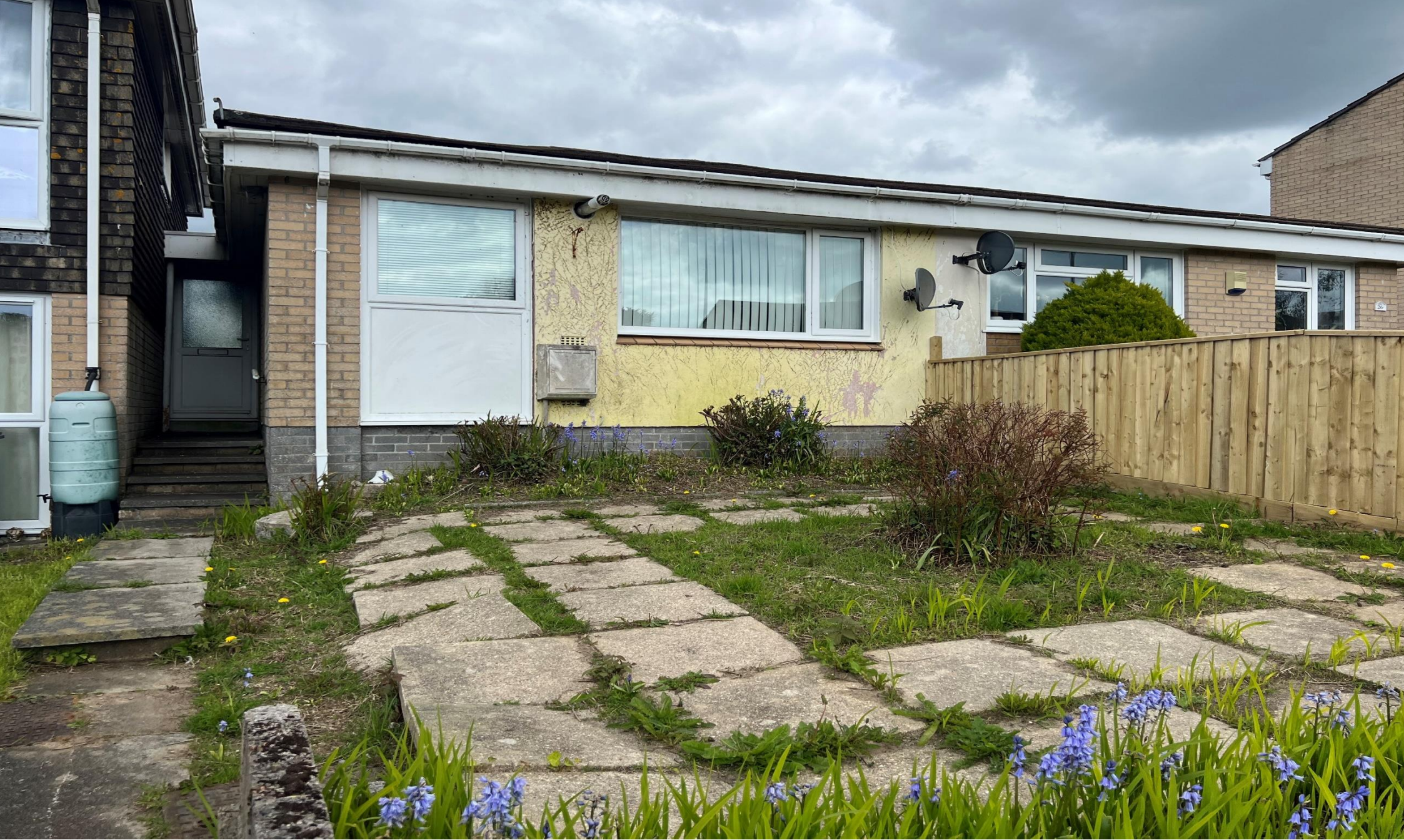
24 Downfield Walk, Plympton, Plymouth, Devon, PL7 2DT