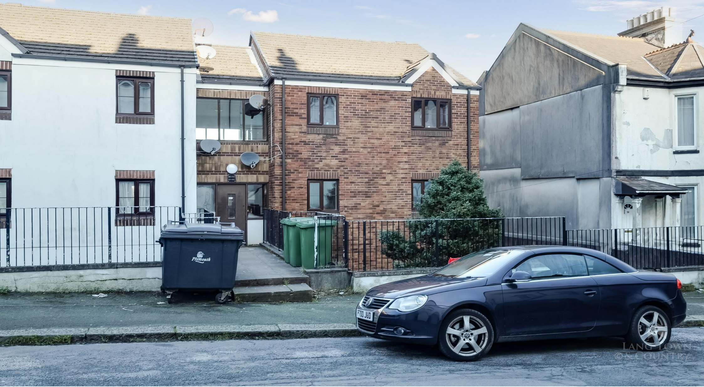
Flat 48, Leaside Court, Northesk Street, Stoke, Plymouth, Devon, PL2 1EZ