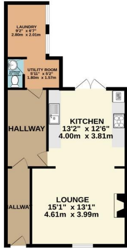
BASEMENT 600 sq.ft. (55.7 sq.m.) approx.