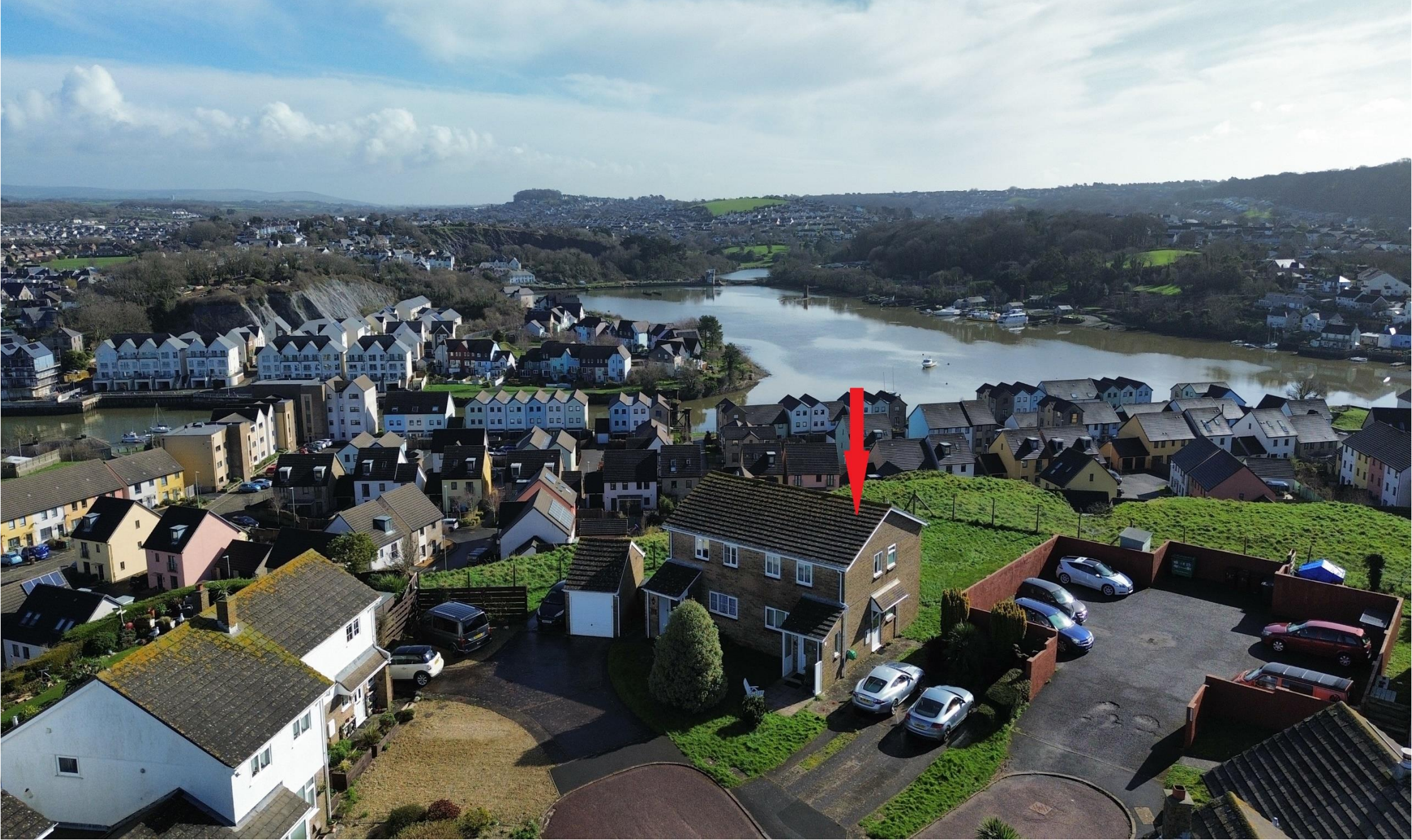
65 Tapson Drive, Turnchapel, Plymouth, Devon, PL9 9UA