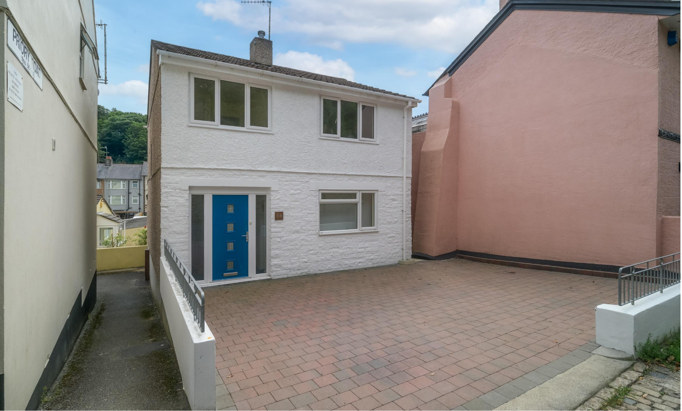
54 Priory Road, Lower Compton, Plymouth, Devon, PL3 5ER