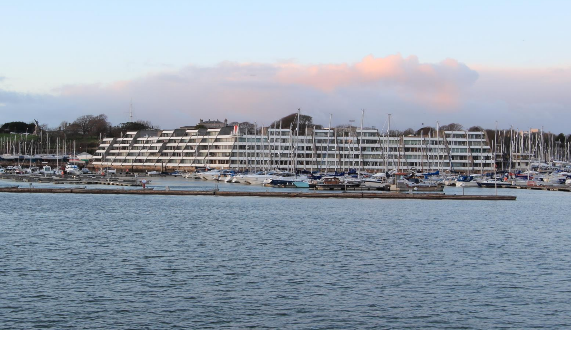
Flat 7, Ocean Court, Richmond Walk, Stonehouse, Plymouth, Devon, PL1 4QA