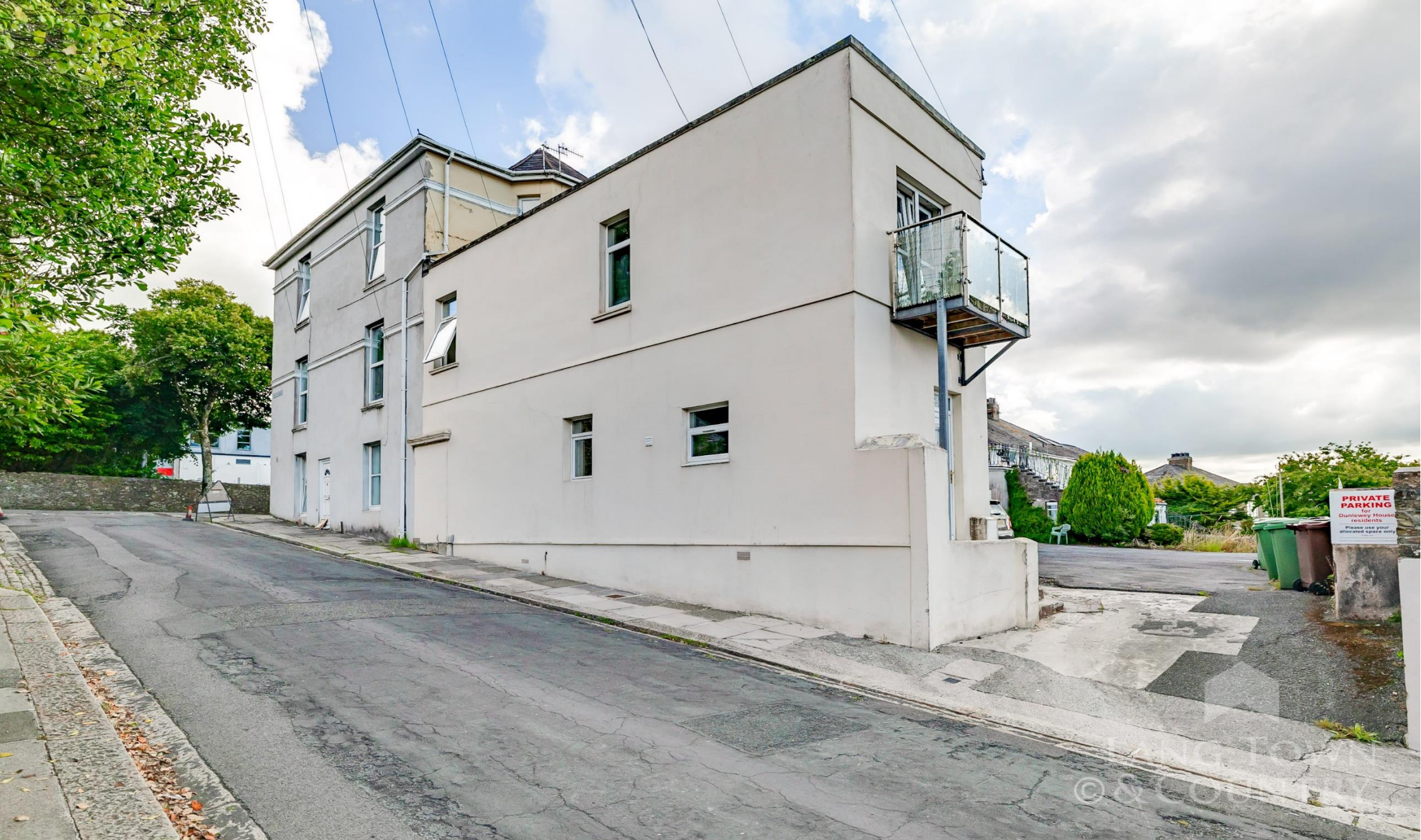
Dunlewey Cottage, Glen Road, Mannamead, Plymouth, PL3 5AP