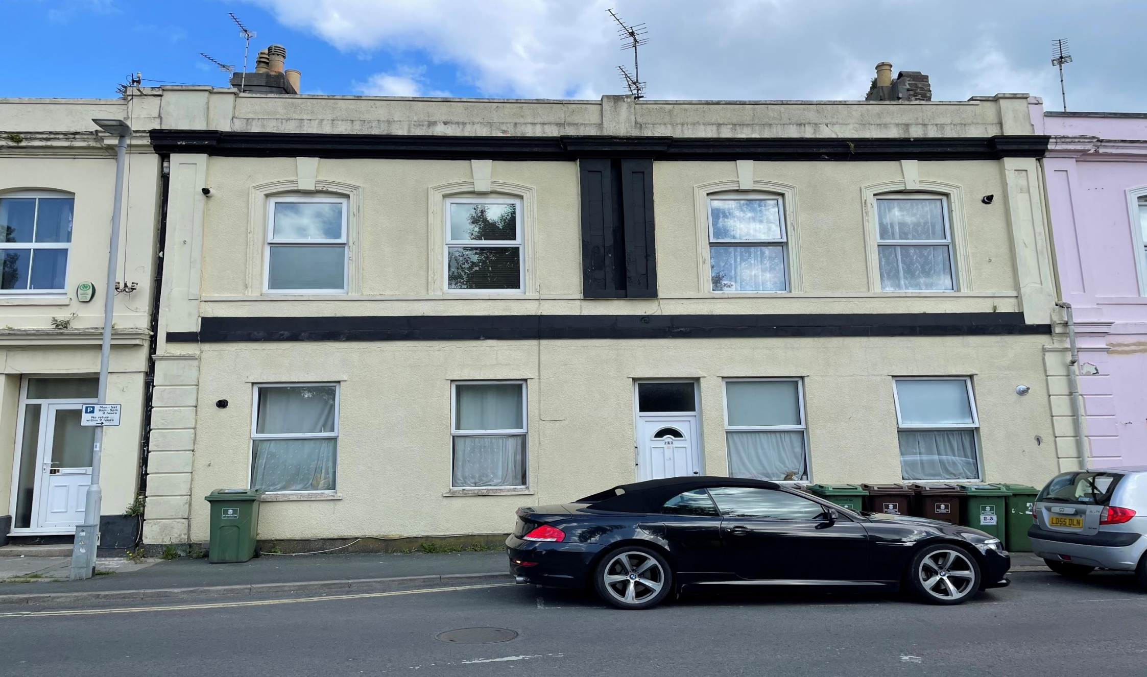
Flat C, 2-3 Patna Place, North Road West, Plymouth, PL1 5AY