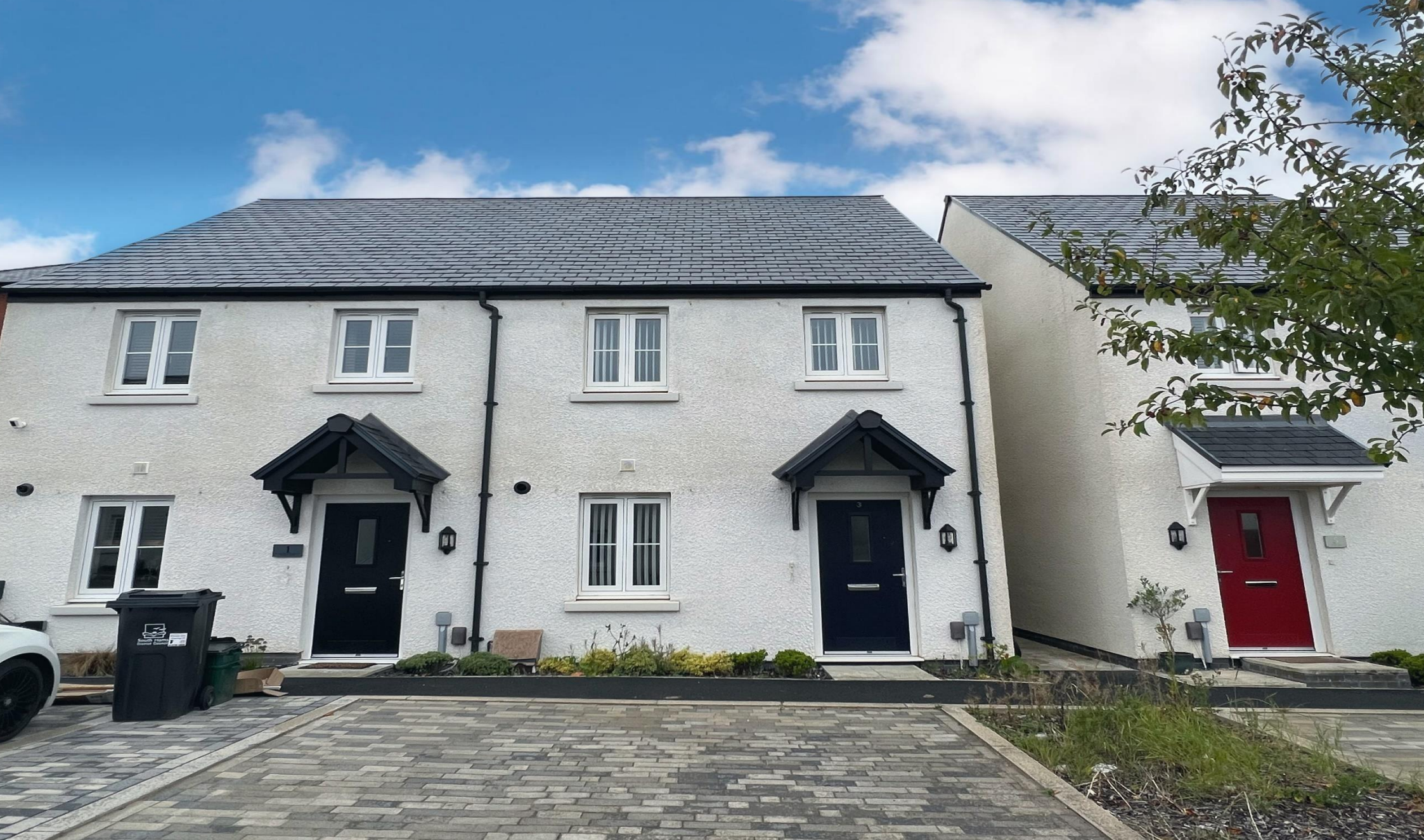
3 Tulip Lane, Sherford, Plymouth, Devon, PL9 8WN