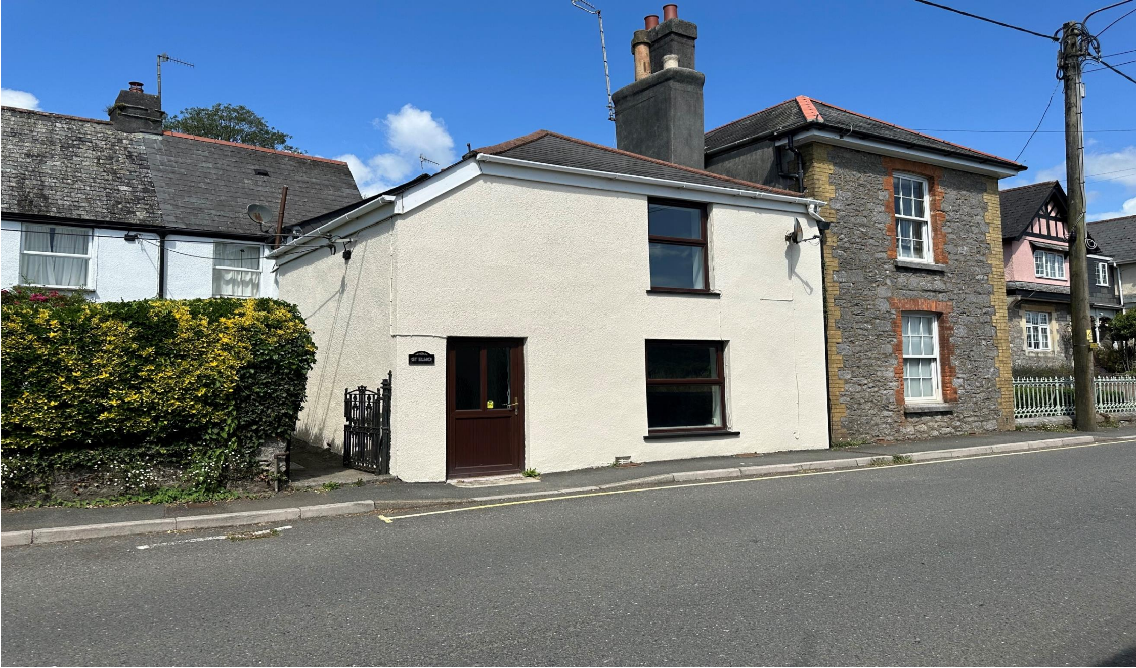
Highfield, Fore Street, Holbeton, Plymouth, Devon, PL8 1NE