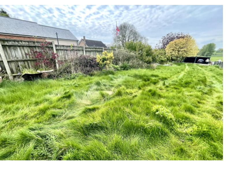
Guide Price: £170,000 - £180,000

3 Chapel Lane, Wymondham Norfolk NR18 0DQ