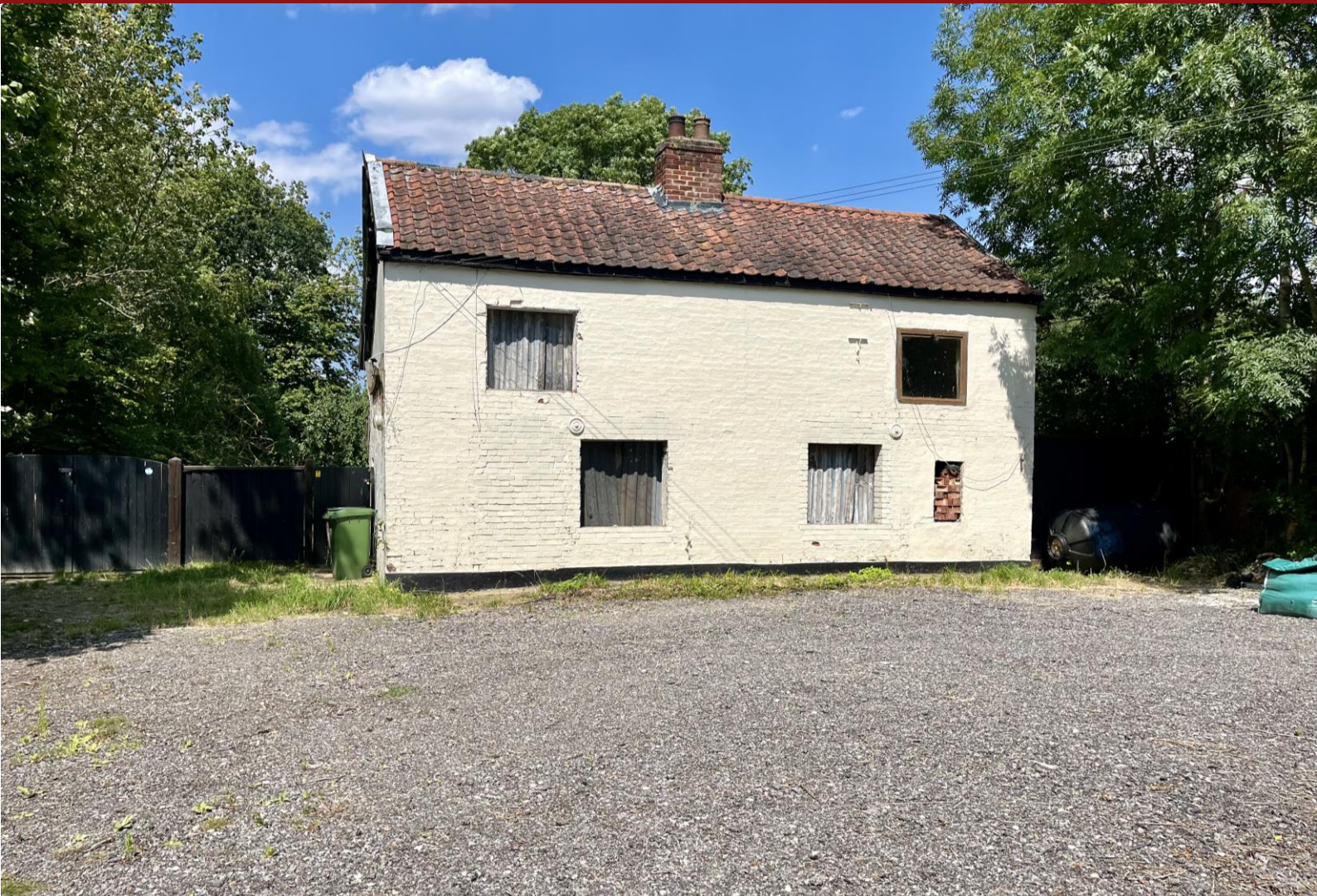
Cargate Cottage Cargate Common Tibenham NR16 1QH