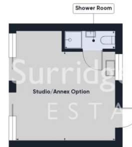
Floor 0 Building 3