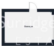
Floor 0 Building 2