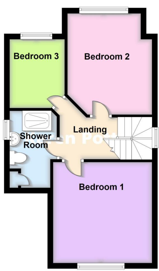
Total area: approx. 87.1 sq. metres (938.0 sq. feet)