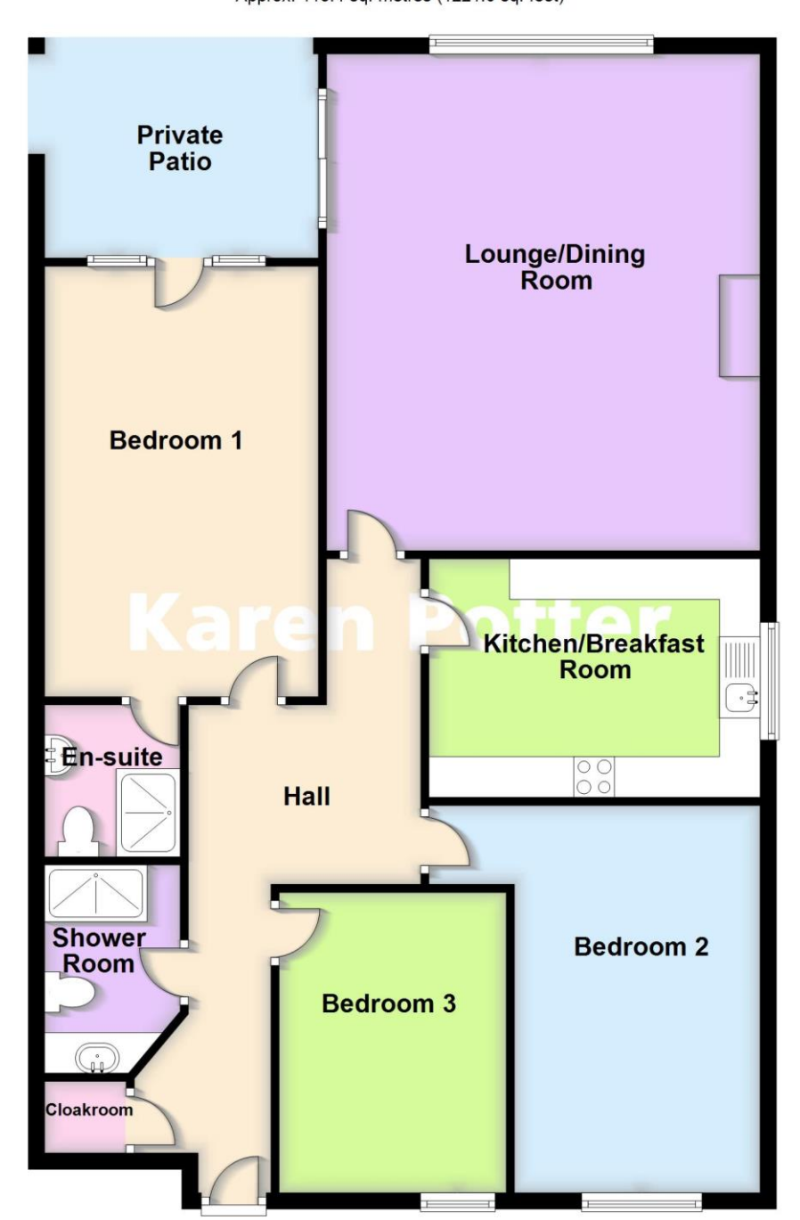
Total area: approx. 113.4 sq. metres (1221.0 sq. feet)