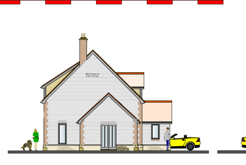
Sandtoft Koramic Old Hollo w 451 Victorian